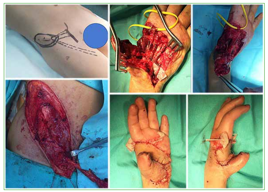
Figure 2. Thumb separation, opening of the first commissure, and carving of a free superficial circumflex iliac artery flap based on the deep branch of the superficial circumflex iliac artery.

After the rehabilitation of the range of motion of the thumb, at eight months, the second surgical stage was carried out, which consisted of reconstruction of the thumb with a transfer of the hemihallux and end-to-side anastomosis to the radial artery and two satellite veins to the veins of the back of the hand (Figure 3).