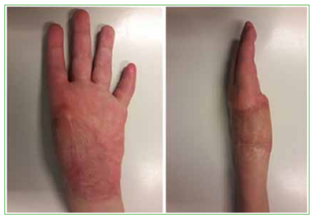
Figure 1. Sequela of injury by dough sheeter machine. Thumb avulsion with distal amputation at the level of F2, type III, with complete inclusion of the thumb in the palm.

A 6-year-old male who suffered an accident in his parents' bakery with the dough sheeter machine, which caused a complete degloving of the thumb and the back of the hand, and a type III amputation of the Allen and Dautel classification (distal to the interphalangeal joint). He was treated through different surgeries at a local hospital. One year after the accident, he was brought to our office. During the evaluation, we observed that the thumb was fully enclosed within the hand and that half of the distal phalanx of the thumb was missing (Figure 1).