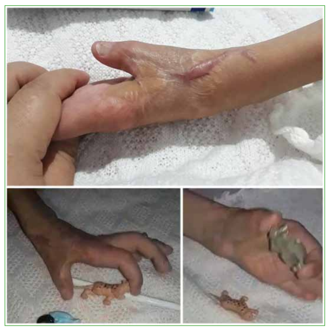
Figure 4. Excellent aesthetic and functional outcomes of the thumb. Note the keloid scar in the dorsoradial region of the wrist.

One year after surgery, the cosmetic appearance and the function of the thumb (Kapandji 8) are good. The only complication is a keloid scar on the back of the wrist (Figure 4).