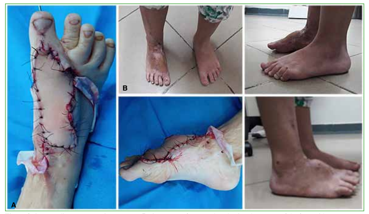
Figure 8. A. Immediate postoperative outcome. B. Outcome at four months, plantigrade support of the foot, without discomfort when wearing closed footwear.