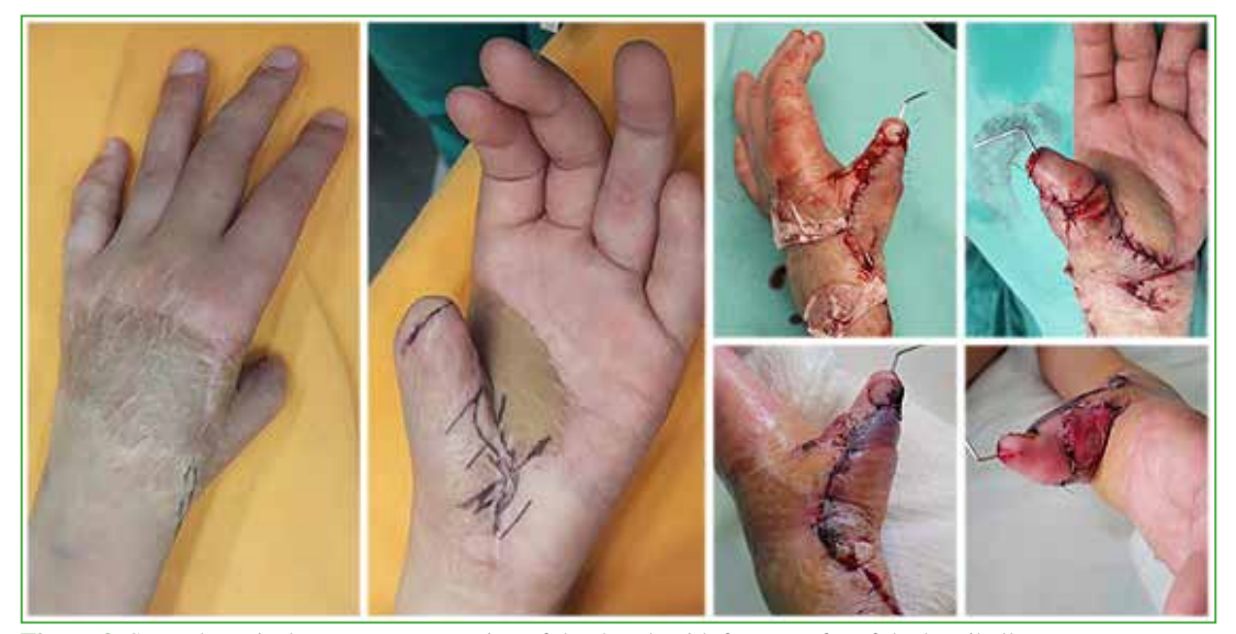
Figure 3. Second surgical stage: reconstruction of the thumb with free transfer of the hemihallux.

After the rehabilitation of the range of motion of the thumb, at eight months, the second surgical stage was carried out, which consisted of reconstruction of the thumb with a transfer of the hemihallux and end-to-side anastomosis to the radial artery and two satellite veins to the veins of the back of the hand (Figure 3).