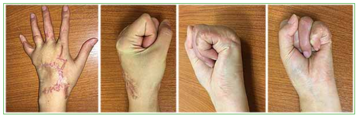
Figure 6. Eight months after surgery, the mobility of the hand is complete and the cosmetic result is excellent. A thin flap that does not require subsequent defatting.

Resection of the pathological tissue and placement of a thin SCIP flap, based on the superficial branch, was planned three weeks after the burn. Due to the need for a long pedicle to construct the radial artery anastomosis, a 14 x 7 cm distal skin flap was carved, in which the superficial perforator pedicle was embedded in a fatty flap. The anastomosis was end-to-side to the radial artery and two veins to the dorsal veins of the hand and wrist. The flap covered the entire dorsal defect and the metacarpophalangeal region of the fingers. After three weeks, the syndactyly was separated at the second and fourth commissures, and at the fifth week, the third commissure was separated. At the eighth month after the operation, the range of motion and function of the hand were complete, with an acceptable aesthetic appearance (Figure 6).