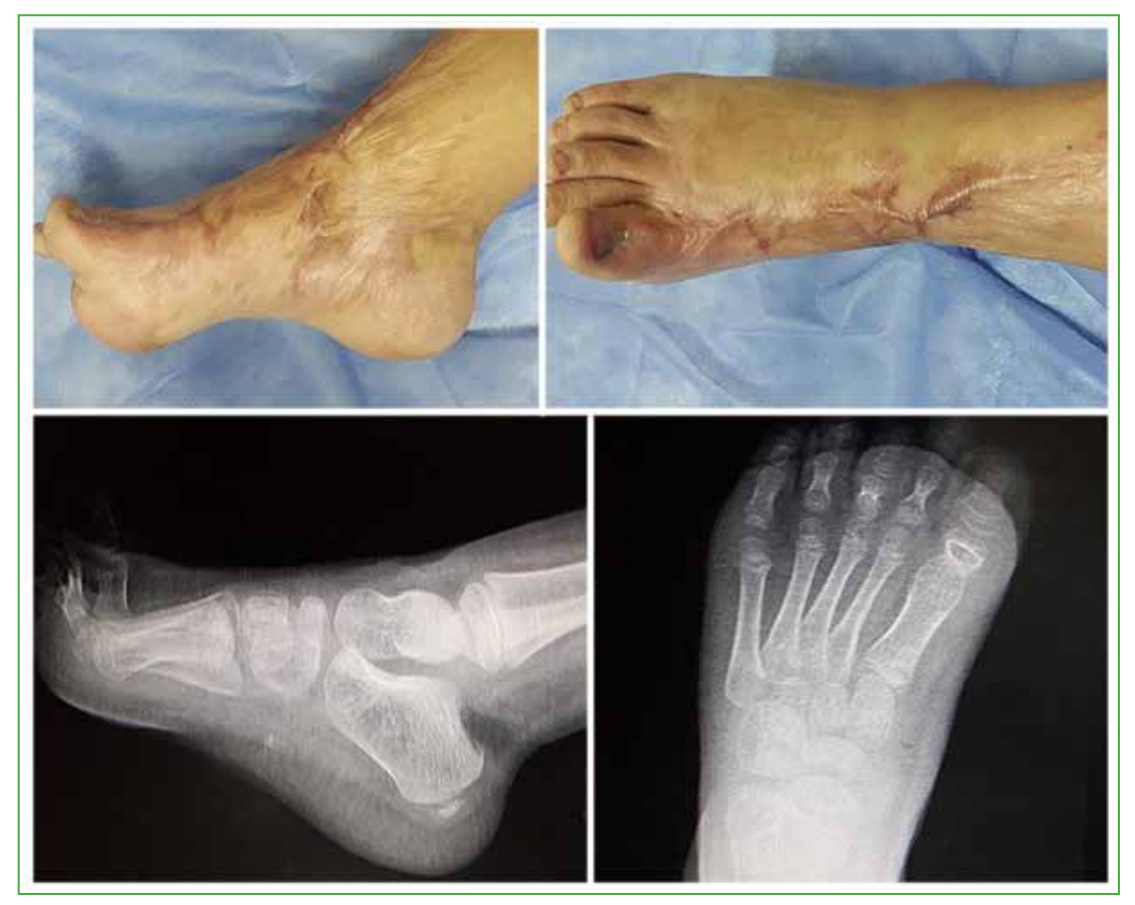
Figure 7. Burn sequela. Cutaneous retraction of the dorsum of the foot with a fixed 90° metatarsophalangeal joint extension deformity.

A 5-year-old girl with a sequela of three years of evolution of a burn with boiling water on the back of her right foot, which caused skin retraction and hallux deformity in fixed extension at 90°. She was subjected to multiple Z-plasties and corrections to no avail. For 30 months, the patient had been unable to put on a shoe due to residual deformity (Figure 7).