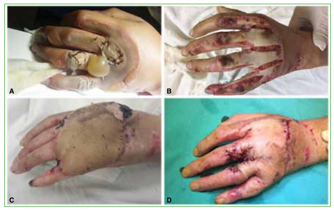
Figure 5. A. Deep burn of the back of the hand and fingers. B. Seven days after longitudinal incisions on the back of the hand and fingers. C. Three weeks after surgery. D. Five weeks after the superficial circumflex iliac artery flap, the commissures were opened.

Resection of the pathological tissue and placement of a thin SCIP flap, based on the superficial branch, was planned three weeks after the burn. Due to the need for a long pedicle to construct the radial artery anastomosis, a 14 x 7 cm distal skin flap was carved, in which the superficial perforator pedicle was embedded in a fatty flap. The anastomosis was end-to-side to the radial artery and two veins to the dorsal veins of the hand and wrist. The flap covered the entire dorsal defect and the metacarpophalangeal region of the fingers. After three weeks, the syndactyly was separated at the second and fourth commissures, and at the fifth week, the third commissure was separated. At the eighth month after the operation, the range of motion and function of the hand were complete, with an acceptable aesthetic appearance (Figure 6).