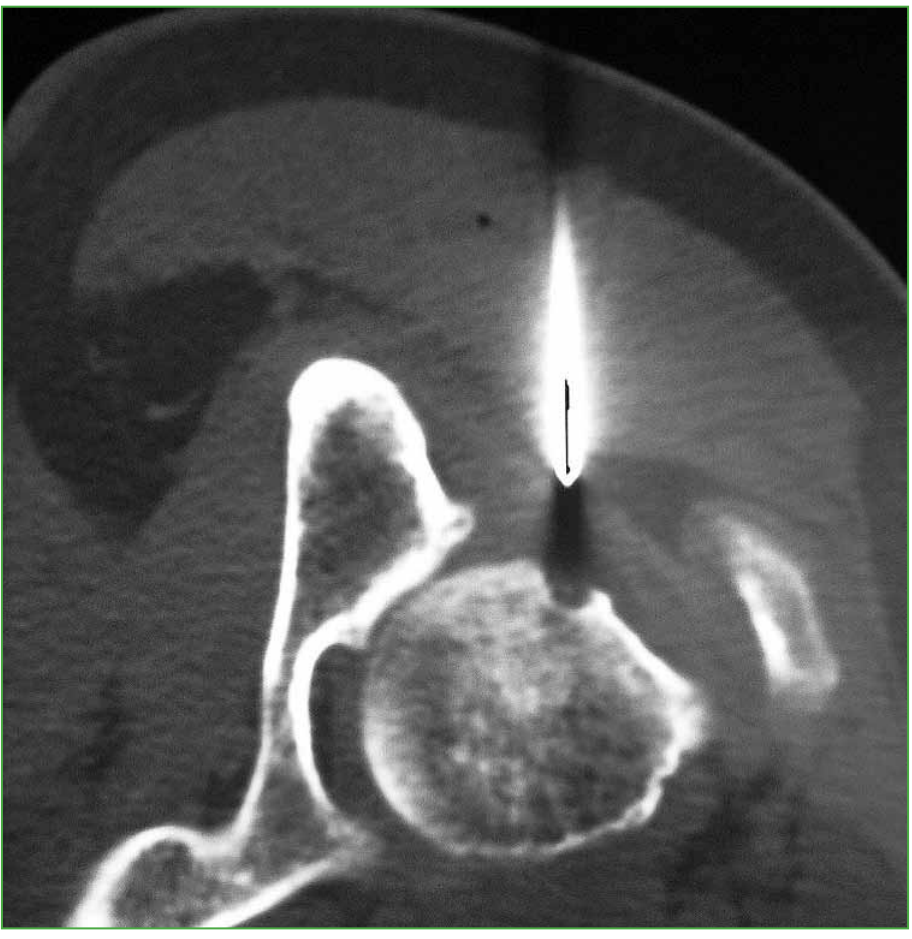
Figure 10. CT-guided radiofrequency ablation.

Conflict of interests: Authors claim they do not have any conflict of interest.