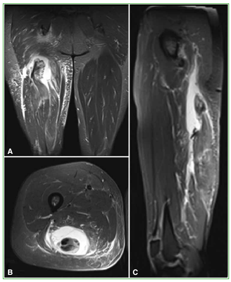
Figure 1. Magnetic resonance imaging of the right thigh. A. Coronal plane, B. axial plane, C. sagittal plane. Tendon injury and retraction.