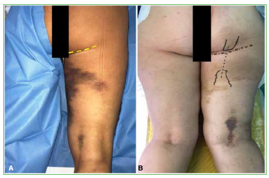
Figure 2. A. Posterior thigh hematoma and outline of the incision through the gluteal fold. B. Outline of the longitudinal incision.