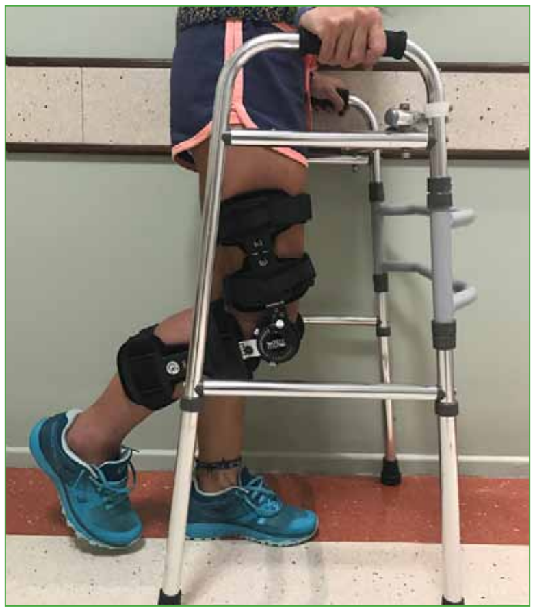
Figure 4. Clinical image of the patient during the postoperative period. Variable fixed-angle splint.

According to published recommendations, at six weeks, total weight bearing begins on the affected limb.<sup>13</sup> After six weeks, we indicate the removal of the immobilizer and allow full weight bearing on the operated limb. From the sixth week onwards, the specific rehabilitation begins. It is indicated to begin with exercises of extension and active and passive flexion of the hip and knee through isotonic exercises and closed chain exercises. This is followed by open-chain exercises that allow the patient to improve and begin to regain strength.<sup>13</sup> It should be noted that strengthening is a necessary factor not only for rehabilitation, but also for the prevention of injury recurrence.