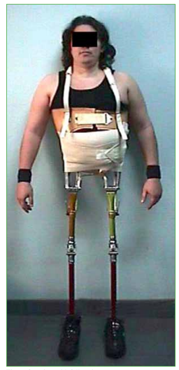
Figure 8. Patient with full equipment.

Once the prosthesis was assembled, the learning process for its use began. Achieving standing was the initial goal of treatment, then ambulation (in a pendulous way with a walker), and finally sitting up and going up and down steps. This entire process lasted approximately six months until the patient achieved independence. Subsequently, he managed to drive adapted vehicles. Finally, the prosthesis was covered with plastic foam to improve its aesthetics (Figure 9).