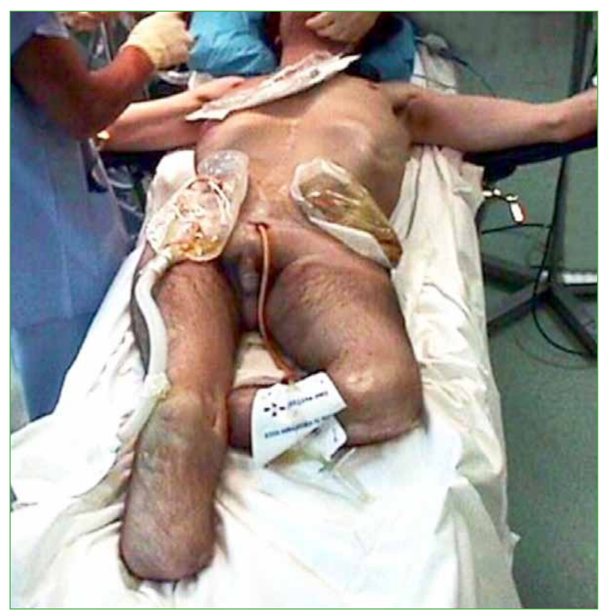
Figure 2. Condition of the patient at the time of surgery.

The procedure was carried out by a multidisciplinary team (traumatology, general surgery, and urology) headed by one of the authors (JF), in a single surgical stage under general anesthesia (Figures 2 and 3).