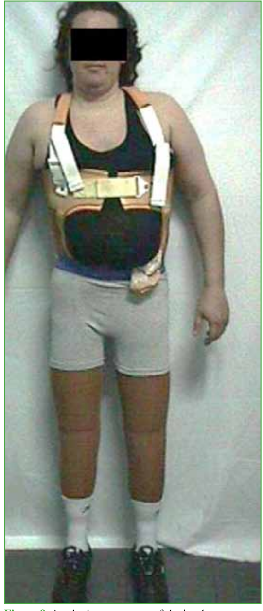
Figure 9. Aesthetic appearance of the implant.