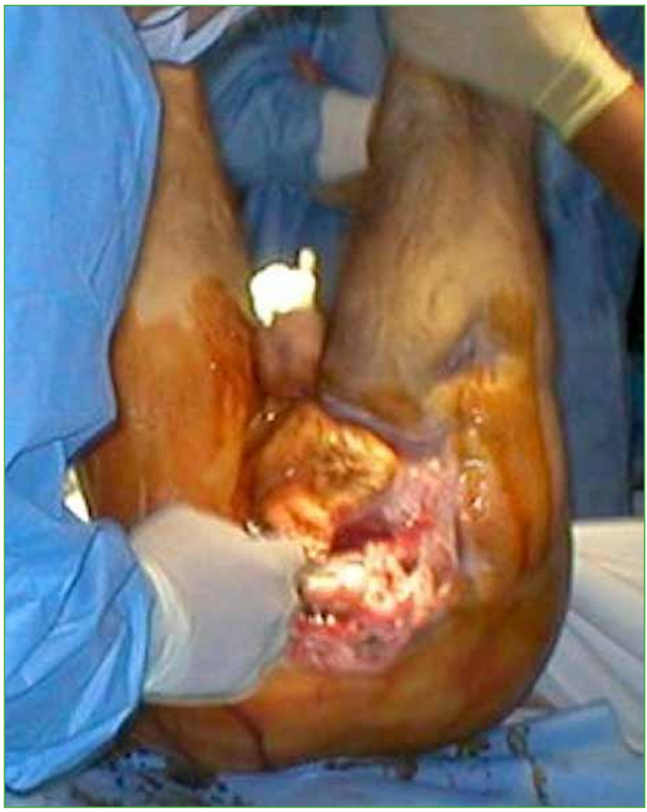
Figure 3. Sacral ulcer.

The surgery began with the patient in the dorsal decubitus position. A bilateral ilioinguinal approach extended to proximal was used to create an anterior flap that later covered the posterior defect (Figure 4). It included a colostomy and a ureteroileostomy. The vena cava and both common iliac arteries were ligated. Batson's plexus was dissected and ligated and disarticulation was performed at L3-L4. 1% lidocaine was administered intraneurally to avoid neurogenic shock and the roots were resected with a bipolar electrosurgical unit. The dura mater was closed with 6-0 Prolene and this closure was confirmed by Valsalva maneuvers.