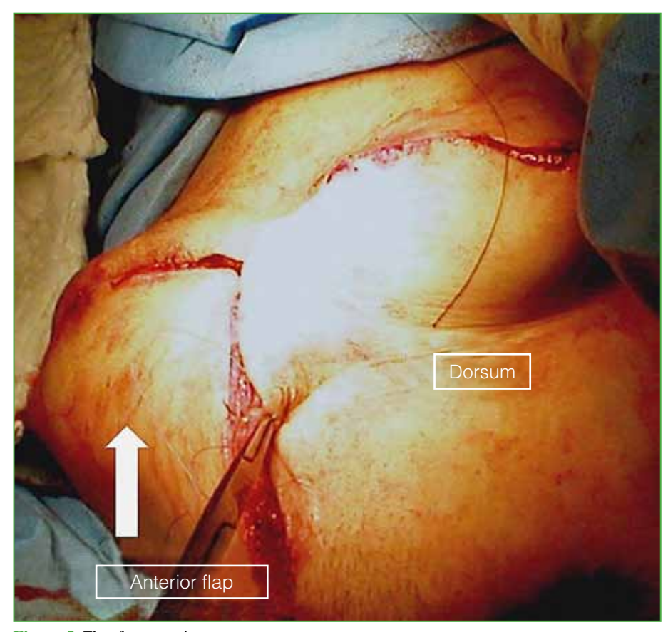
Figure 5. Flap for posterior coverage.