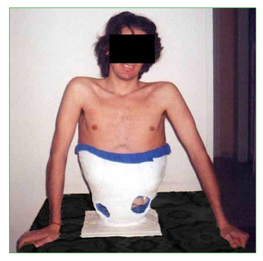
Figure 6. Preparation of the plaster bucket with flat support.