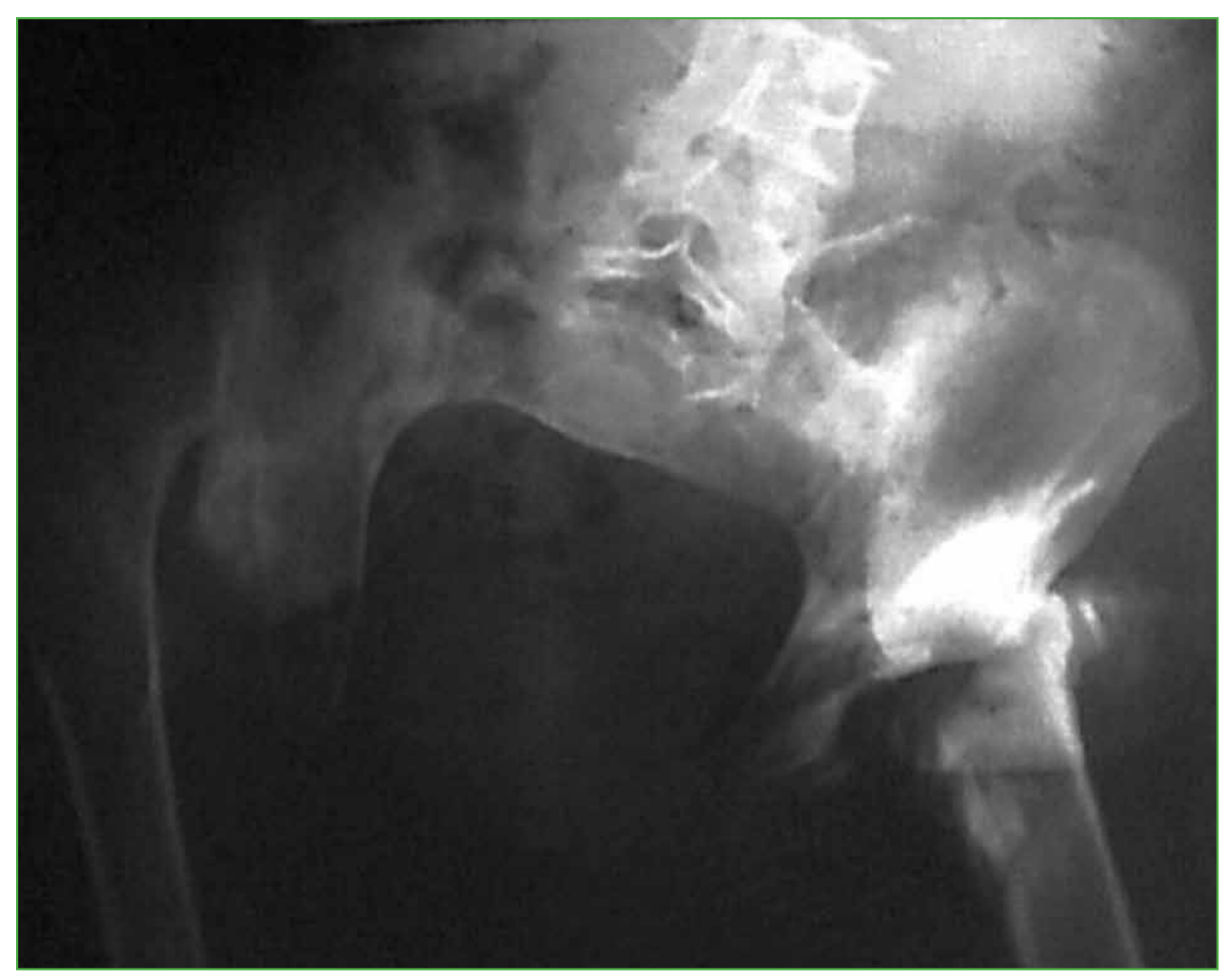
Figure 1. Anteroposterior pelvic radiographs showing osteomyelitis.

A 25-year-old man who had suffered a motorcycle accident five years before. The injury produced a fracture at the D10 level and a condition of paraplegia with a sensitive level compatible with the injury. His neurological status was classified as Frankel A. Poor hygienic care caused multiple bedsores on his legs, sacrum, and trochanters, which forced him to undergo several surgical procedures, including infrapatellar amputation of both legs (Figure 1). This irreversible condition continued to evolve and ended with the development of massive pelvic osteomyelitis that required a permanent suprapubic cystostomy and Hartman surgery (colostomy).