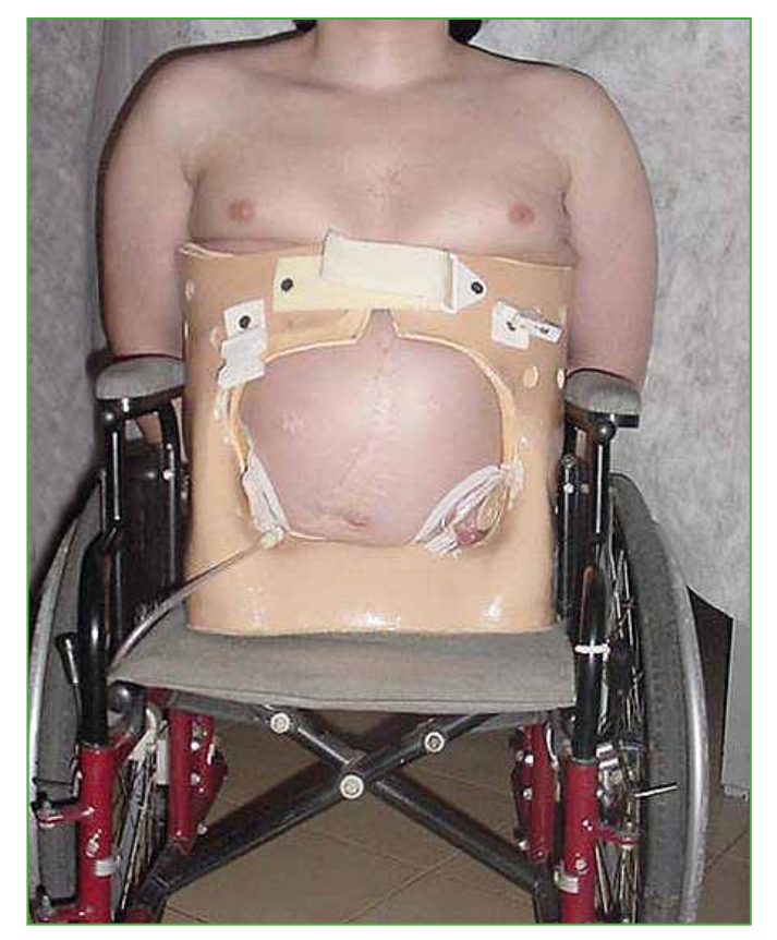
Figure 7. Manufacture of the bucket corset from an acrylic and carbon laminate, with Polyform inner padding and rib support.