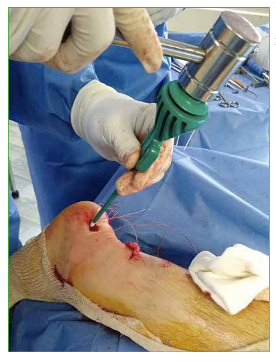
Figure 7. The ankle is plantar flexed to properly tighten the Achilles tendon and an assistant holds it in place. Sutures are passed through the eyelet of the SwiveLock® Anchor (Arthrex), and the anchor is gently inserted into the calcaneal drill hole and hand-tightened until it reaches bone level.