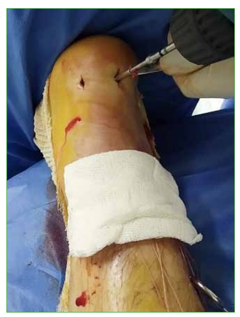
Figure 6. The Banana SutureLasso <sup>TM</sup> (Arthrex) with inner nitinol wire is passed through the distal stump of the Achilles tendon and through a proximal incision to retrieve one side of the proximal suture.

Figure 5. Two 5 mm longitudinal incisions are made along the posterior aspect of the heel along the sides of the Achilles tendon insertion. The drill (3.5mm) and drill guide are used through each incision oriented slightly toward the midline.