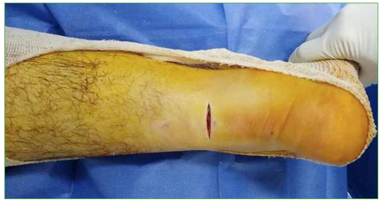
Figure 1. 2 cm transverse skin incision on the proximal aspect of the palpable defect in the midsubstance Achilles tendon.