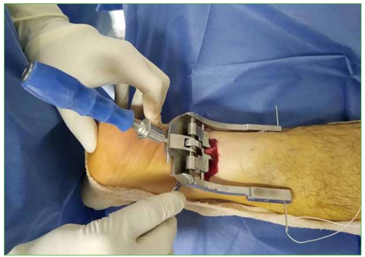
Figure 2. Percutaneous Achilles tendon Repair System (Arthrex) in the incision, advanced proximally into the paratenon. A passing needle is placed through the jig and tendon for preliminary fixation.