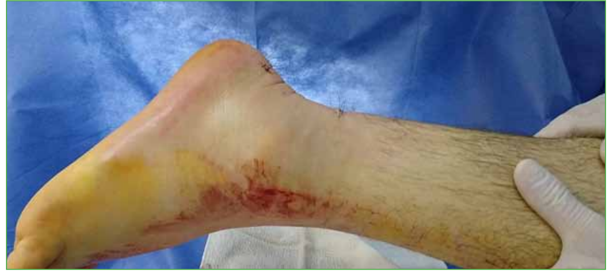
Figure 8. After the final repair, the plantar flexion of the ankle at resting position is evaluated and the Thompson test is performed.

Figure 7. The ankle is plantar flexed to properly tighten the Achilles tendon and an assistant holds it in place. Sutures are passed through the eyelet of the SwiveLock® Anchor (Arthrex), and the anchor is gently inserted into the calcaneal drill hole and hand-tightened until it reaches bone level.