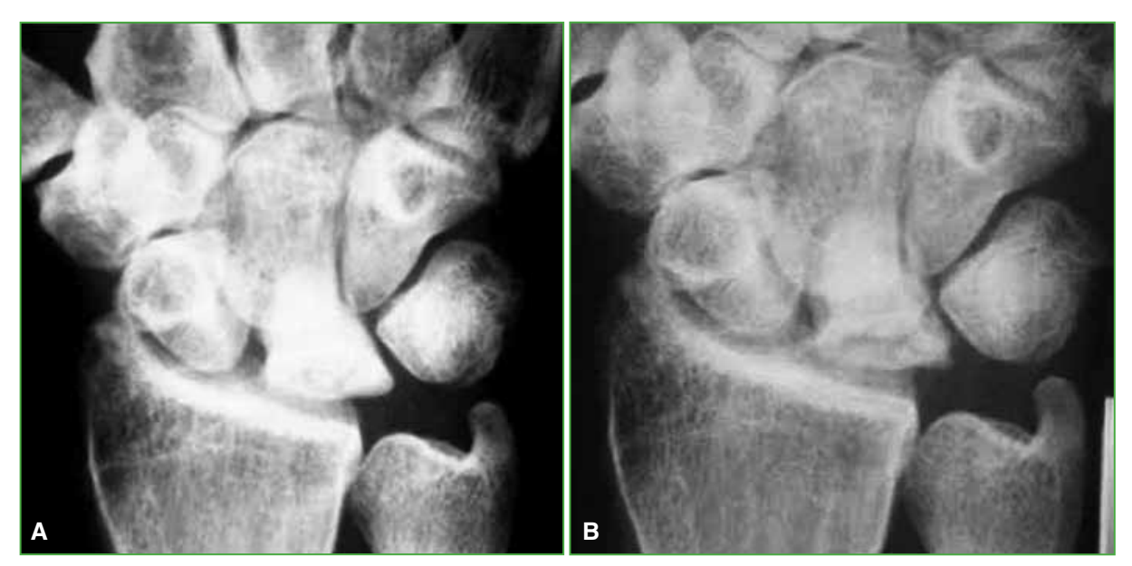
Figure 2. A 45-year old woman with stage 3A Kienböck's disease. A. Initial X-rays. B. Radiographic control at 12-year follow-up.

The authors reported good motion restoration and pain relief, with only 4 patients with complaints of mild pain. Most of the patients (17 out of 22) did not show disease progression at last follow-up, 2 showed radiographical improvements and 3 showed radiographical disease progression. In 2017, De Carli et al. published a series of 15 stage 3A Kienböck's disease patients, with a 13-year mean follow-up. Based on the Mayo Wrist Score, outcomes were excellent in 6 patients, good in 8 patients, and poor in 1 patient (Figure 2).<sup>31</sup>