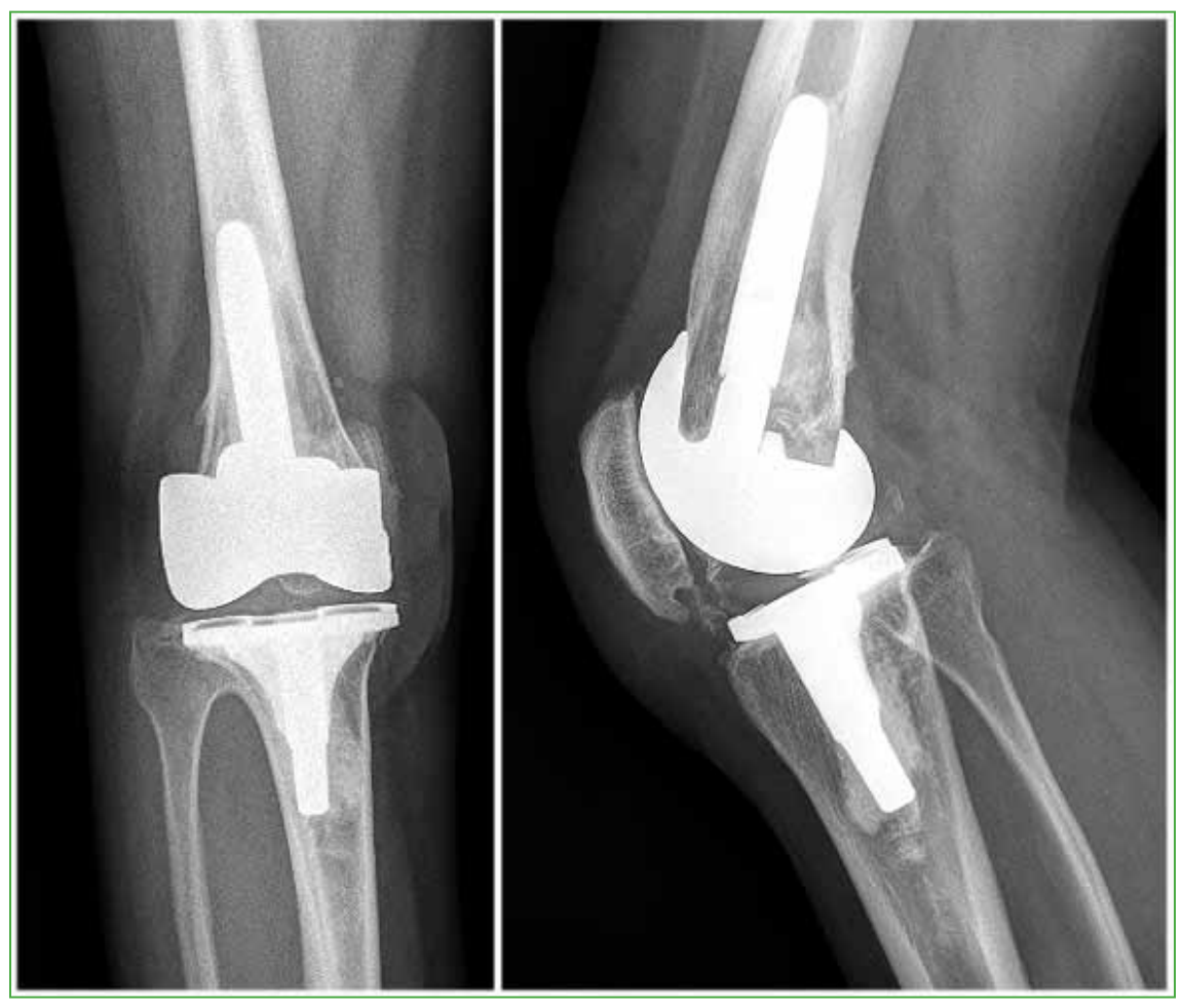
Figure 3. Postoperative anteroposterior and lateral radiograph of the right knee.

Radiographs show no signs of loosening (Figure 3). The KSS on the right knee improved to 86/90. The patient manifests to be satisfied with the results obtained.