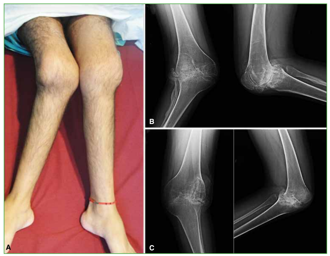
Figure 4. A. Clinical image of both knees showing coronal deformity and ankylosis. B and C. Preoperative anteroposterior and lateral radiographs of the right and left knee.