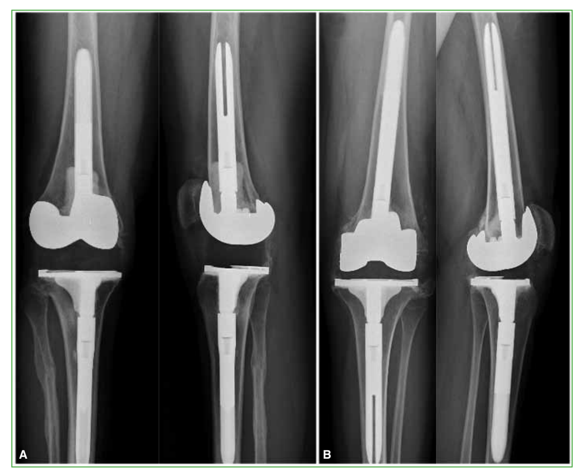
Figure 6. Postoperative anteroposterior and lateral radiographs of the right (A) and left (B) knee.