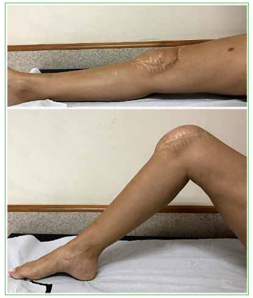
Figure 2. Clinical images of the postoperative range of motion.

At 13 years of follow-up, the patient has a range of motion of 90°, with a full extension (Figure 2).