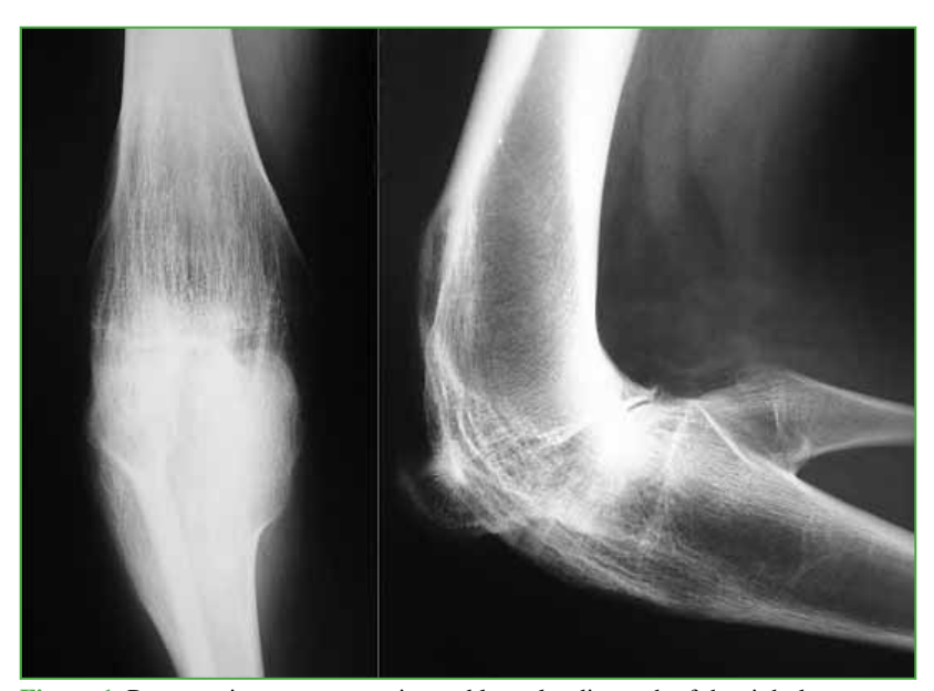
Figure 1. Preoperative anteroposterior and lateral radiograph of the right knee.

An 18-year-old woman with juvenile rheumatoid arthritis and a surgical intervention during childhood. She presented ankylosis of the right knee in 100° flexion, without significant deformity in the coronal plane. The left knee had a range of motion of 90°, with a flexion contracture of 30°. She had difficulty walking, going up and down stairs, and sitting down. The Knee Society Score (KSS) of the right knee measured before surgery was 26/50. On radiographs, both tibiofemoral and patellofemoral bone ankylosis of the right knee could be observed (Figure 1).