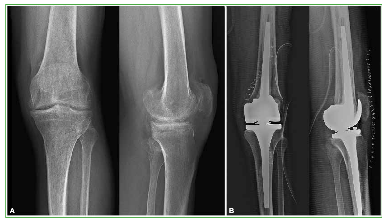
Figure 7. Preoperative (A) and postoperative (B) anteroposterior and lateral radiographs of the left knee.