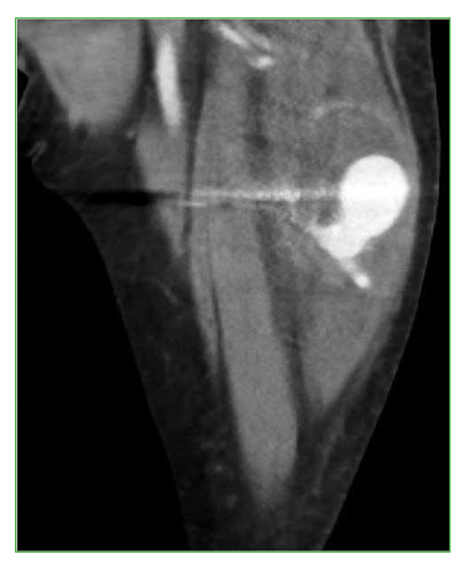
Figure 1. CT angiography of the pseudoaneurysm dependent on the lateral territory of the deep femoral artery.