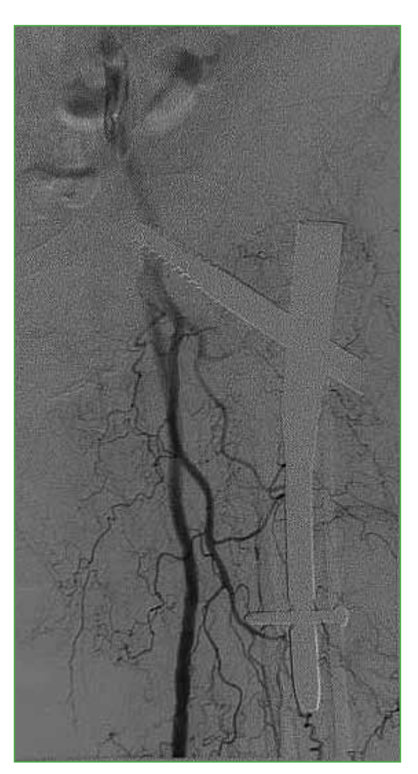
Figure 2. Arteriography revealing the lack of an image compatible with pseudoaneurysm and osteosynthesis with the intramedullary nail.