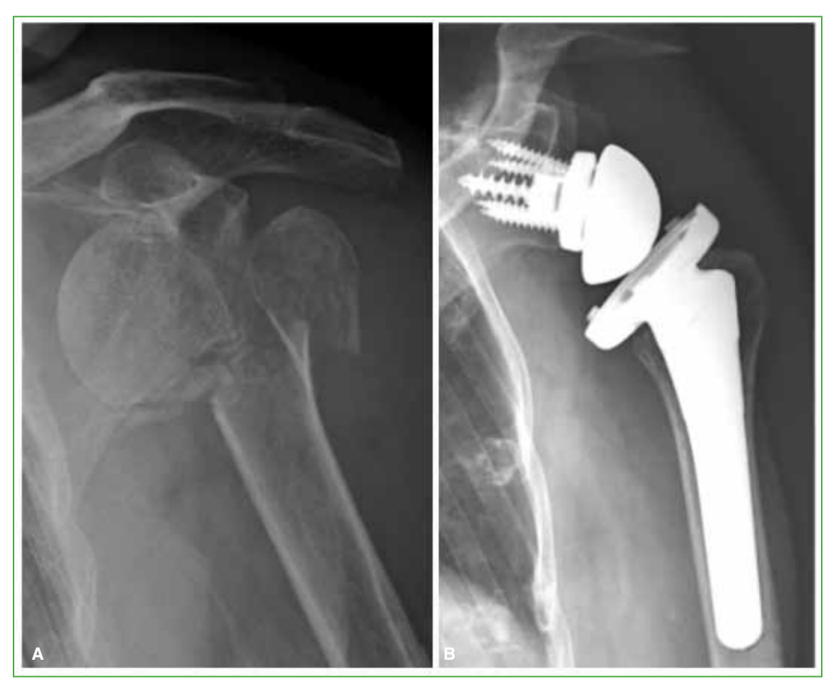
Figure 2. Anteroposterior left shoulder radiographs of a fracture of the left proximal humerus, in the preoperative period ( \mathbf{A} ) and one year after surgery with a reverse prosthesis ( \mathbf{B} ). The anatomical consolidation of the tuberosities is observed.

All intraoperative and postoperative complications and reoperations were documented.