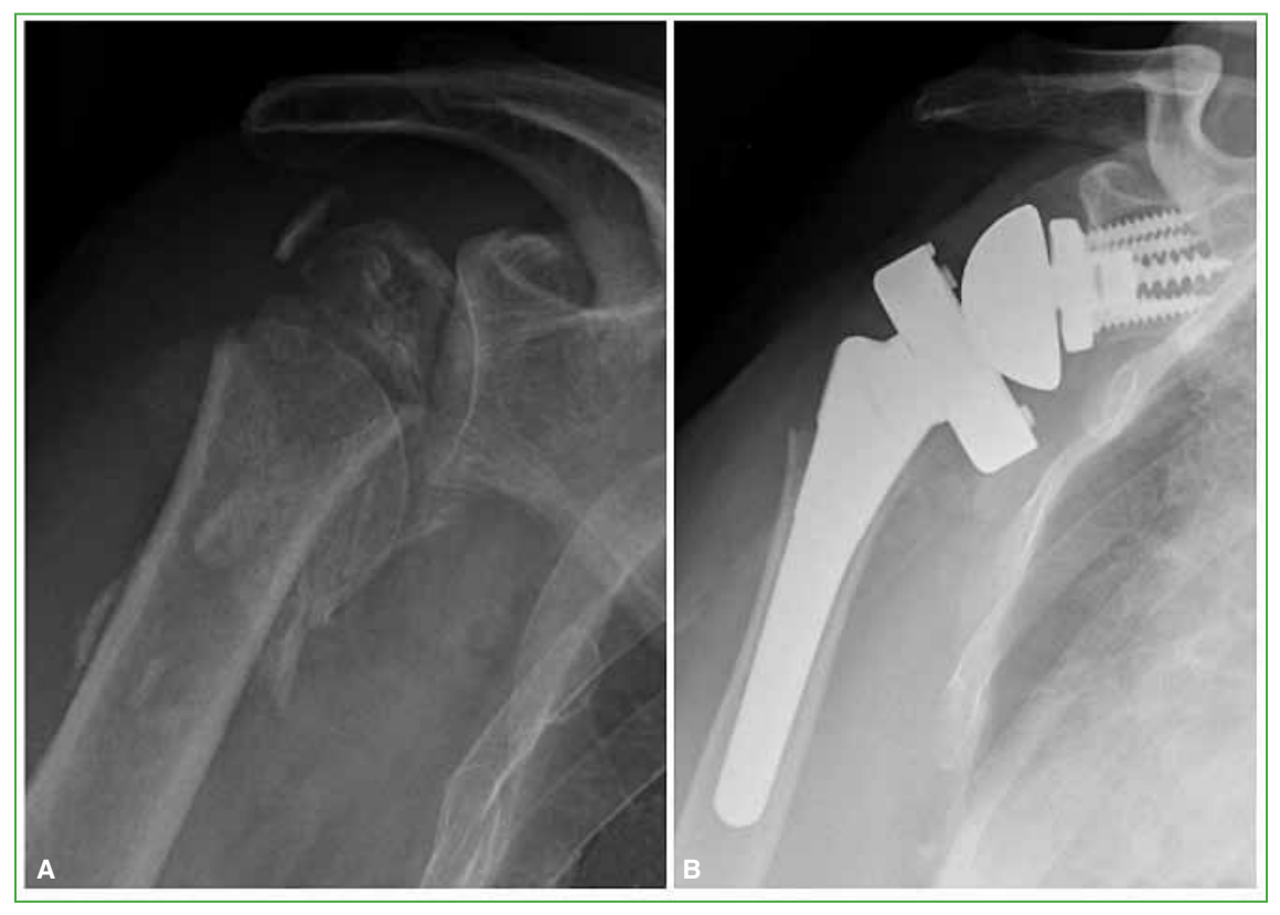
Figure 3. Anteroposterior radiograph of the right shoulder, preoperative (A) and one year after surgery for a fracture of the right proximal humerus treated with an reverse arthroplasty. Resorption of the tuberosities is observed.