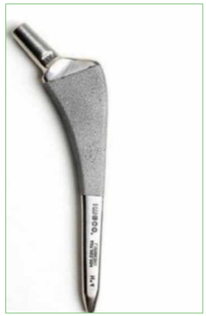
Figure 1. IMECO S.A. CEMENTFREE® stem.

We retrospectively evaluated total hip replacements performed between January 2015 and August 2020. All patients were implanted with the IMECO S.A. CEMENTFREE® femoral stem (Figure 1).