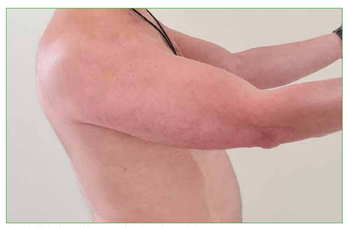
Figure 5. Clinical image of the contour of the biceps after tenodesis.

No general complications, such as infections, or related to the surgical technique were recorded. No disinsertions of the tenodesis (Popeye's sign) were observed (Figure 5).