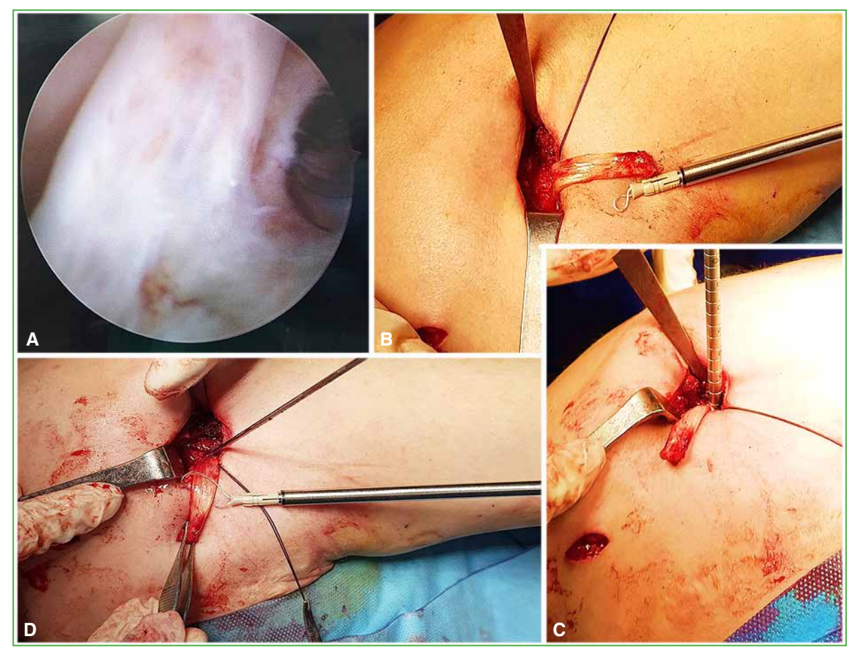
Figure 4. A. Posterior arthroscopic view of a SLAP II injury and biceps with tenosynovitis. B. The biceps was recovered through the suprapectoral approach. The detail of the anchorage used for the tenodesis can be observed. C. Carving of the bone tunnel in the humerus before placement of the guide (cannulated wick). D. Detail of the tendon looping technique to ensure its introduction into the humerus before tenodesis.