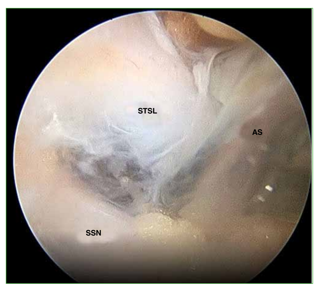
Figure 6. Arthroscopic imaging. Arthroscopic scissors were used to cut the transverse scapular ligament. SSN = suprascapular nerve; STSL = superior transverse scapular ligament. AS = arthroscopic scissors.

Using a blunt trocar through the medial suprascapular nerve portal, as a retractor of the trapezius muscle, the transverse ligament was cut with arthroscopic scissors through the lateral suprascapular nerve portal. Then, it was possible to visualize the released and uncompressed suprascapular nerve (Figure 6).