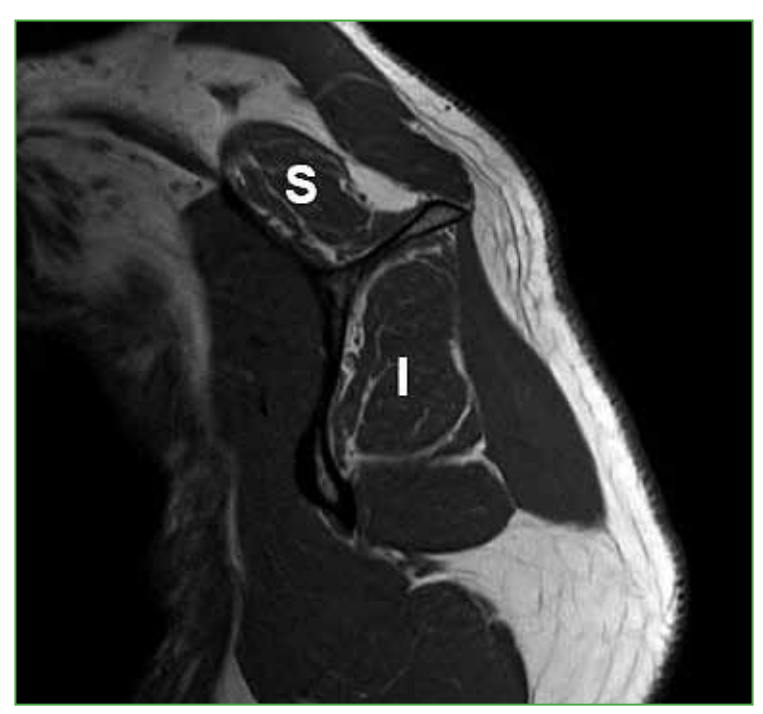
Figure 4. MRI of the left shoulder, sagittal view, T1-weighted sequence. Fatty infiltration of the supraspinatus (S) and infraspinatus (I) muscles can be observed.

At first, the patient refused surgical treatment and underwent kinesiotherapy. After 12 months without improvement, he consulted again. A new MRI and neurography were indicated, and signs of subacute denervation with fatty infiltration and a decrease in the volume of the supraspinatus-infraspinatus muscle (hypotrophy) were detected in the T1-weighted sequence (Figure 4).