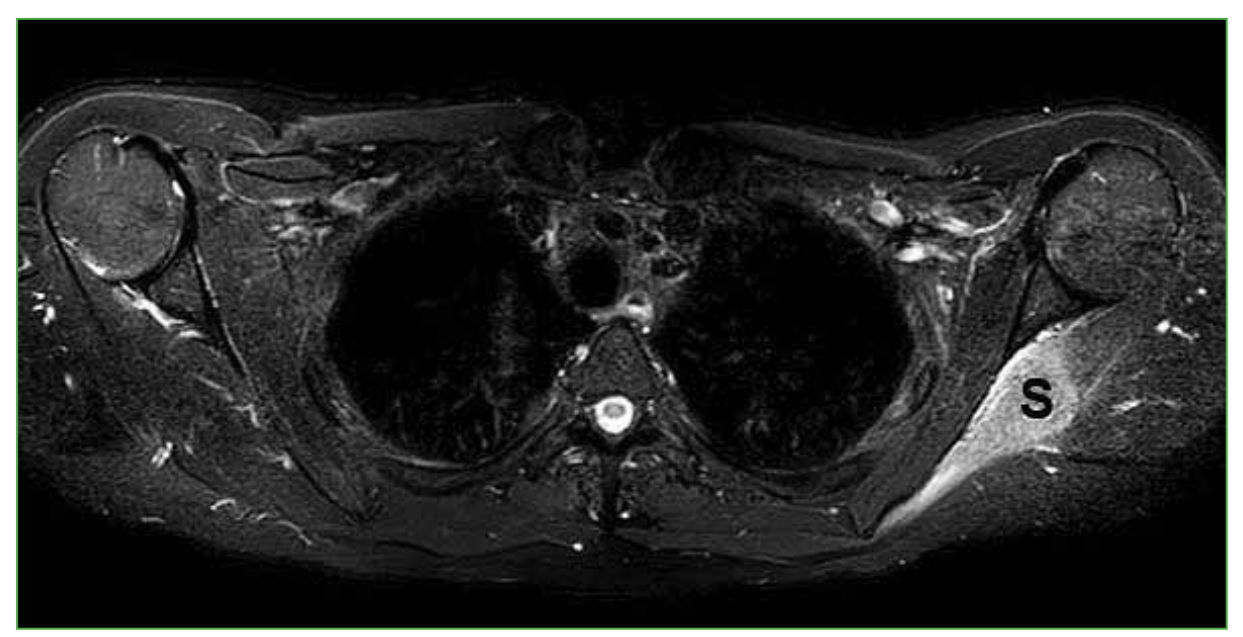
Figure 2. MRI of the left shoulder, axial section, STIR sequence. Edema is observed in relation to the supraspinatus muscle (S).

A 55-year-old man who practiced field hockey and had no relevant pathology history. He had developed a dull pain in his shoulder and scapula three months prior to the consultation. The pain had permanently increased (7/10 according to the visual analog scale) and, after a few weeks, was associated with hypotrophy of the supraspinatus and infraspinatus muscles. This caused severe external rotation paresis (M3 according to the Daniels scale). It is important to mention that he did not have a limited range of motion, but rather pain and motor weakness. Initially, an MRI of the shoulder and scapular region without contrast medium was requested, which showed subacute changes in muscle denervation with an increase in signal in the STIR sequence related to changes in edema (Figure 2).