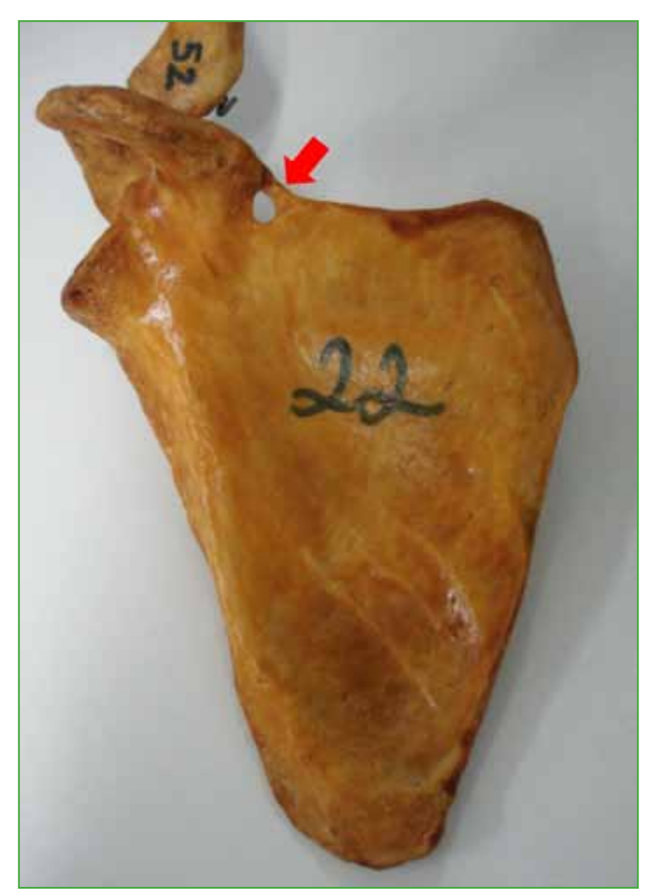
Figure 1. Anterior view of the right scapula. The red arrow indicates the ossified transverse scapular ligament.

The suprascapular nerve is a mixed nerve that emerges from the ventral ramus of the spinal nerve (C5) or from the upper trunk of the brachial plexus (C5-C6) and often receives an additional supply from C4.<sup>3</sup> From its origin, the nerve runs, covered by the trapezius and omohyoid muscles, through the posterior triangle of the neck, following the course of the suprascapular artery, until it reaches the scapular notch, converted into an osteofibrous hole by the superior transverse scapular ligament. In certain cases, the notch is observed to be almost or completely closed by bone tissue and it turns, then, into a bone hole (Figure 1), these are enthesopathic changes in the lateral and medial insertions of the superior transverse scapular ligament.<sup>69</sup>