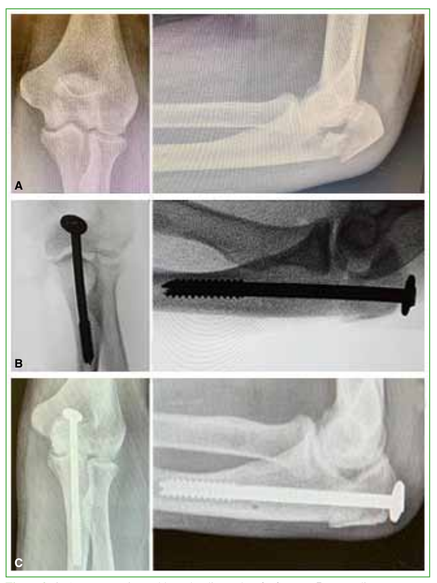
Figure 2. A. Anteroposterior and lateral radiographs of a fracture. B. Immediate postoperative period. C. Consolidated fracture at week 10.

Six patients with simple displaced type IIA fracture of the olecranon were identified and were treated with highstrength sutures and an intramedullary partial-thread cannulated screw with a 6.5 mm washer. Four patients were men and two were women, and the average age was 43 years (range 24-60). Immediate postoperative radiographic controls were performed, and at weeks 2, 6 and 10 (Figure 2).