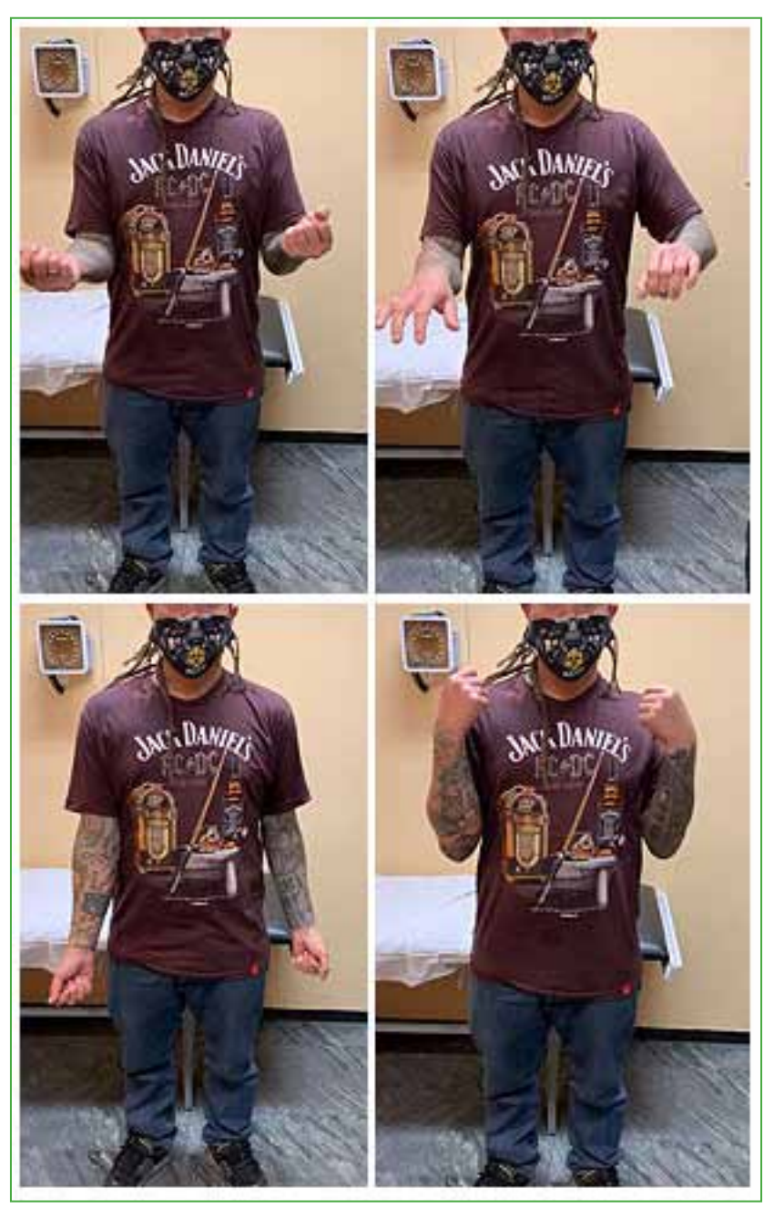
Figure 3. Postoperative range of motion - 6 weeks.

Bone consolidation was confirmed in all patients, except for one who developed elbow joint stiffness due to poor follow-up with delayed consolidation (16.6%). He continued with occupational therapy and achieved bone consolidation and recovery of the range of motion. There were no wound complications nor revision surgeries. The average flexion was 143° (range 160°-90°) and the average extension was 19° (range 0°-55°). All reached full pronosupination (Figure 3 and Table).