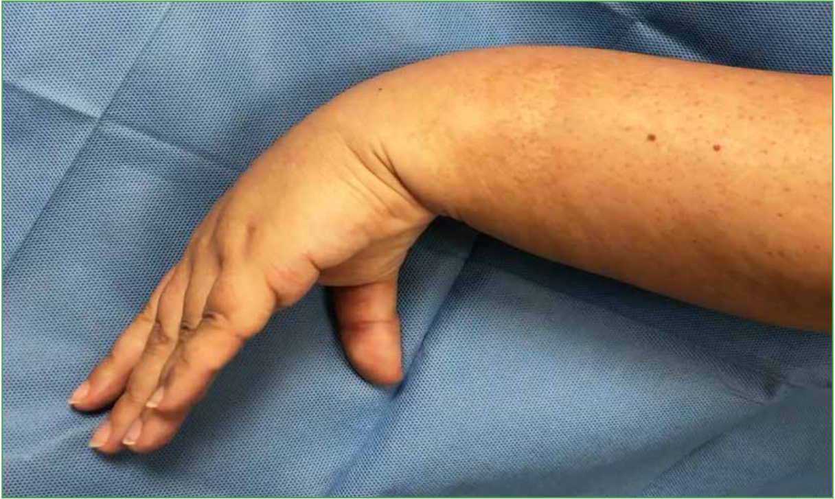
Figure 2. Wrist drop. A characteristic sign of radial nerve palsy.