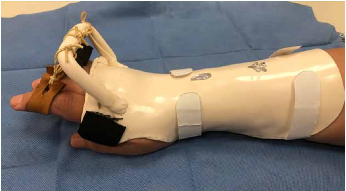
Figure 3. Thermoplastic splint for the rehabilitation of radial paralysis.