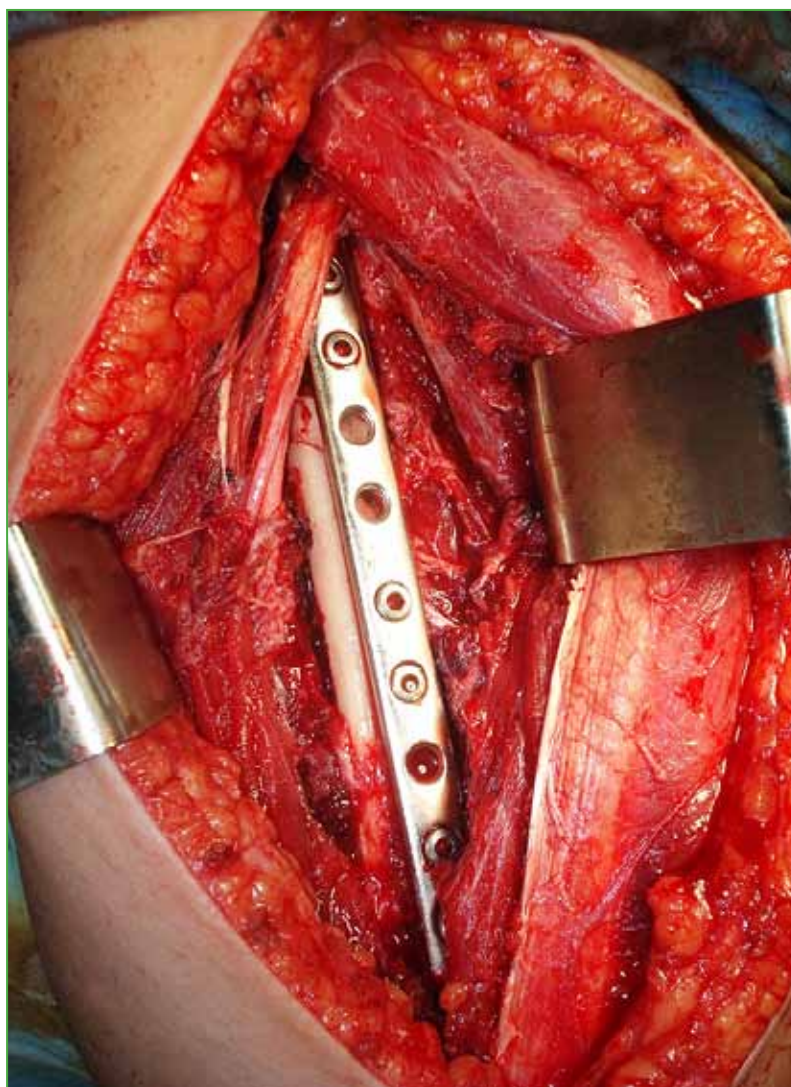
Figure 1. Relationship of the radial nerve with the straight plate on the posterior aspect of the humerus. Treatment of a diaphyseal fracture of the humerus.

Causes of iatrogenic radial nerve palsy include manipulative trauma during fracture surgery (Figure 1), impingement of the nerve by fragments of the fracture itself, entrapment by the fracture callus, and scar tissue formation. 3