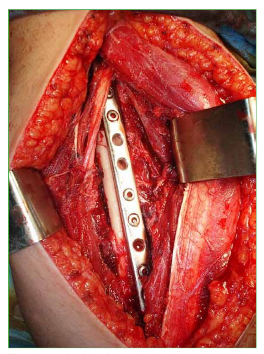
Figure 1. Relationship of the radial nerve with the straight plate on the posterior aspect of the humerus. Treatment of a diaphyseal fracture of the humerus.

Causes of iatrogenic radial nerve palsy include manipulative trauma during fracture surgery (Figure 1), impingement of the nerve by fragments of the fracture itself, entrapment by the fracture callus, and scar tissue formation.<sup>3</sup>