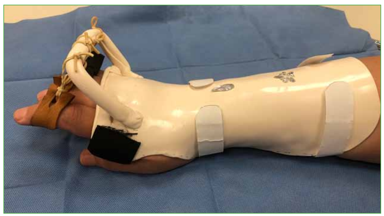
Figure 3. Thermoplastic splint for the rehabilitation of radial paralysis.