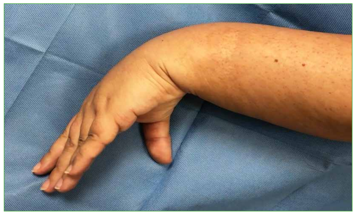
Figure 2. Wrist drop. A characteristic sign of radial nerve palsy.