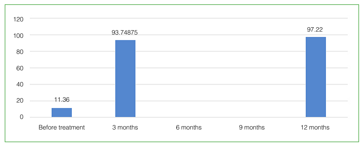
Figure 2. Simple Shoulder Test in the group treated with intraarticular corticosteroid.

As mentioned above, patients undergoing surgery were excluded; however, it would be important to assess the specific indications for surgery because, as has been indicated in international series, this type of treatment is reserved for young, high-demand individuals or those who need to return to work quickly, as well as for those suffering from metabolic diseases that have been shown to respond poorly to conservative treatment.<sup>11,12</sup>