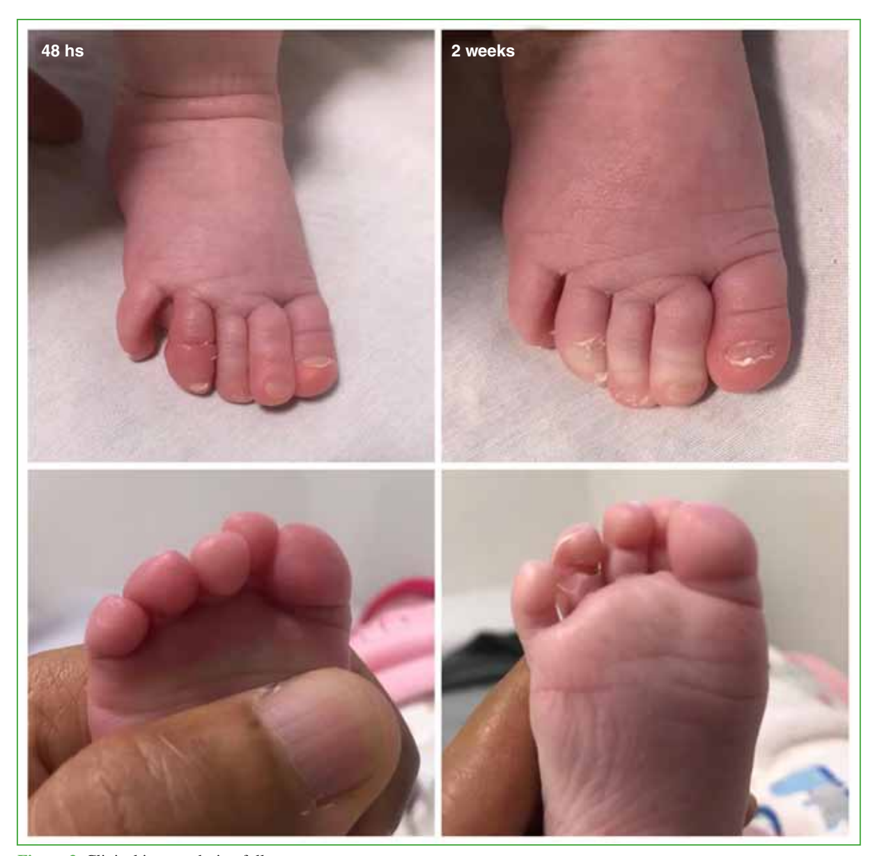
Figure 3. Clinical images during follow-up.

After hair removal, distal perfusion improved and edema decreased within a few minutes (Figure 3). The patient was monitored the next day in the outpatient clinic of the Children's Orthopaedics and Traumatology Service and a good evolution of the condition was confirmed. At the last follow-up at 10 days, the distal circulation of the finger had completely recovered, she had no edema, and she was discharged.