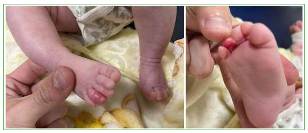
Figure 1. Clinical images at admission.

The patient is a 3-month-old patient, born at 33 weeks gestation, with neonatal anemia, on supplemental iron treatment and neurorehabilitation. The family consulted the emergency department of our institution because the girl had persistent edema of the fourth toe of the right foot, without being able to specify the time of evolution. Physical examination revealed congestive edema of the fourth toe, erythema, and pain to the touch and passive mobilization (Figure 1).