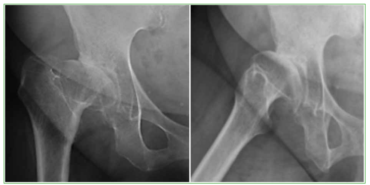
Figure 2. Anteroposterior and axial radiographs of the hip showing hip osteoarthritis secondary to Legg-Calvé-Perthes disease.