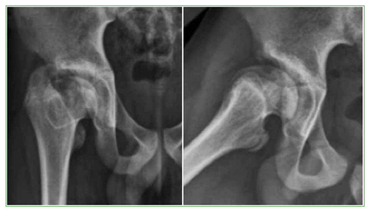
Figure 1. Anteroposterior and axial radiographs of the hip showing residual deformities of Legg-Calvé-Perthes disease.

Likewise, a literature search was carried out in databases such as PubMed, Medline, Cochrane, Clinical Key, with keywords such as "total hip arthroplasty", "Perthes disease" and "secondary hip osteoarthritis".