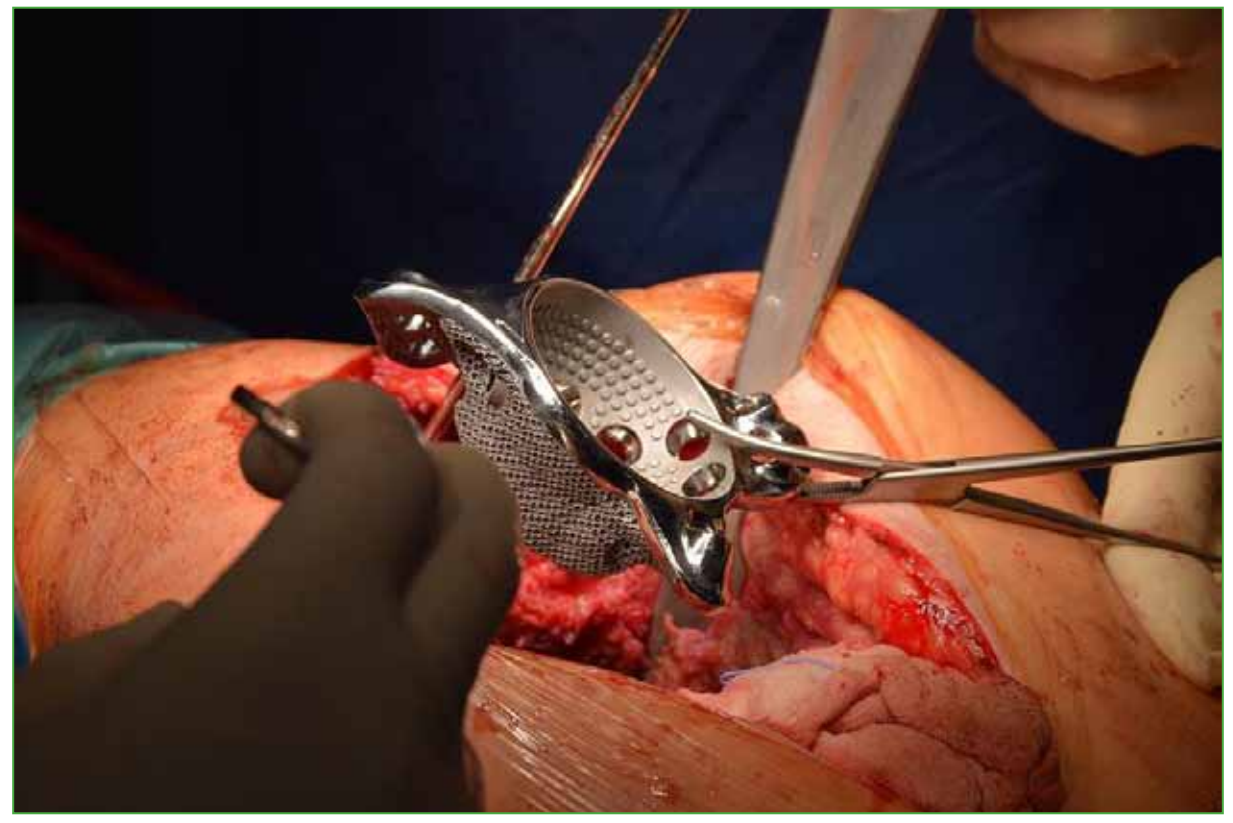
Figure 1. Intraoperative image. Customized acetabular implant before insertion in the acetabular defect.