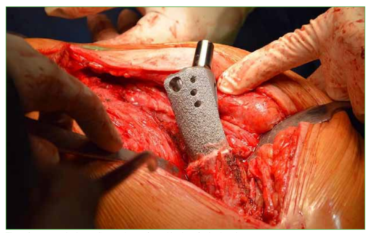
Figure 2. Intraoperative image. Cemented tumor femoral implant after implantation.