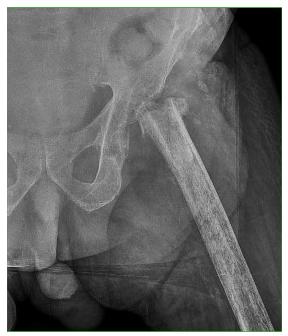
Figure 3. Preoperative anteroposterior radiograph of the pelvis. Femoral and acetabular defects before surgery.

In June 2019, he attended outpatient consultations at our hospital center to evaluate definitive treatment (Figure 3).