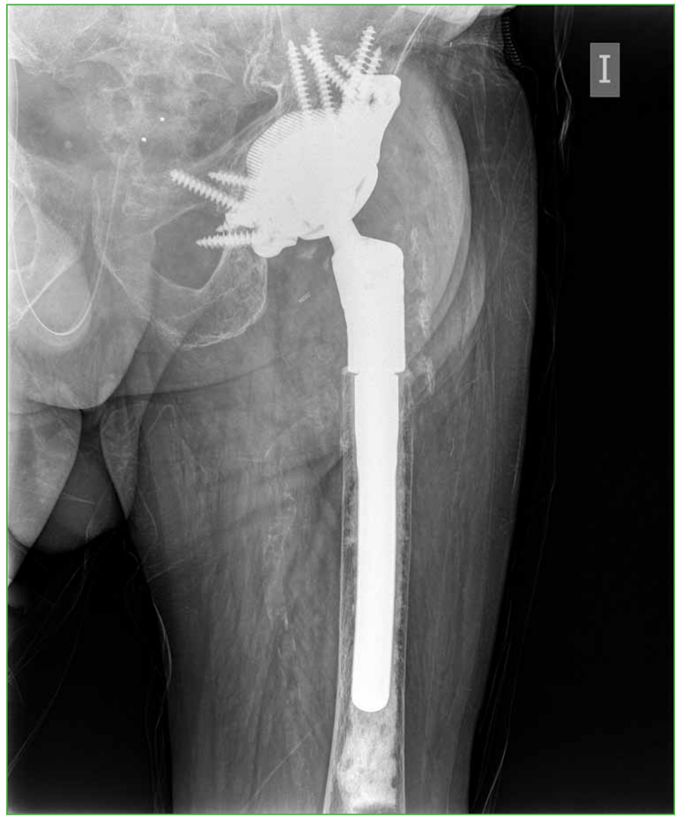
Figure 7. Anteroposterior radiograph of femur. Control after two years of evolution.

Articles have been published on this therapeutic choice, such as that of Van Eemeren et al.,<sup>7</sup> who also presented a clinical case operated on using a "customized" cup, but via the anterior approach.