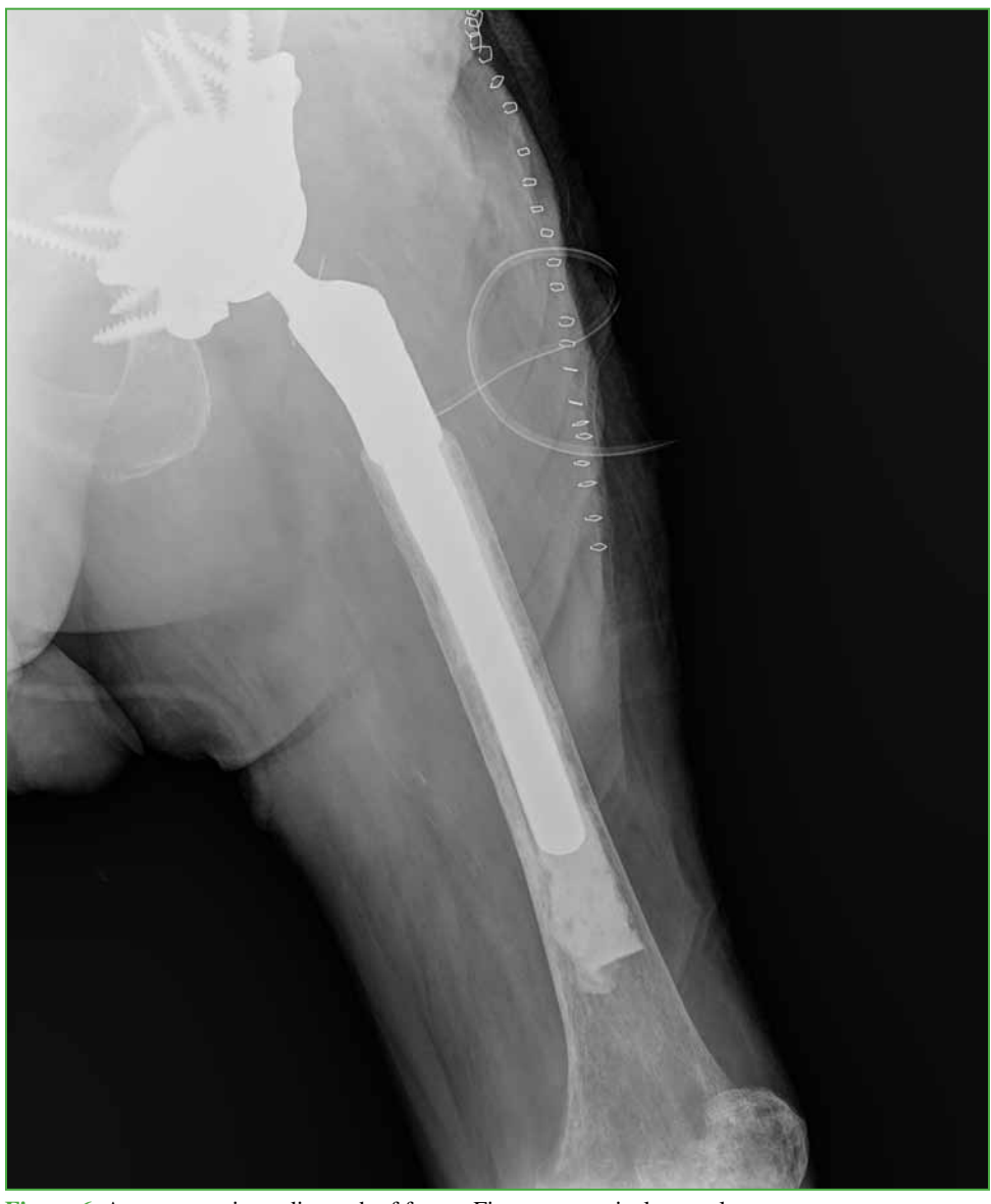
Figure 6. Anteroposterior radiograph of femur. First post-surgical control.