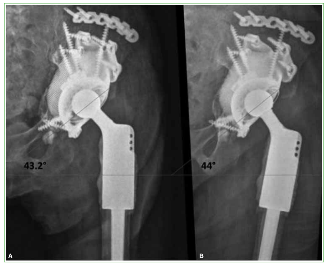
Figure 3. Anteroposterior radiographs of the left hip. Radiographic control of inclination and anteversion. A. Immediate postoperative period. B. 29 months after surgery.

Anteroposterior radiographs of the pelvis, and alar and obturator radiographs of the affected hip were taken one week, one month, and three months after surgery and then annually. Following Manaster's criteria,<sup>10</sup> no signs of loosening or migration of the 3D cup in terms of inclination and anteversion were observed in any case in the last control (Figure 3), so that the medium-term implant survival, according to the Kaplan-Meier method, is 100% (Table 3). A control CT scan was performed three months after surgery where the osseointegration of all implants was confirmed.