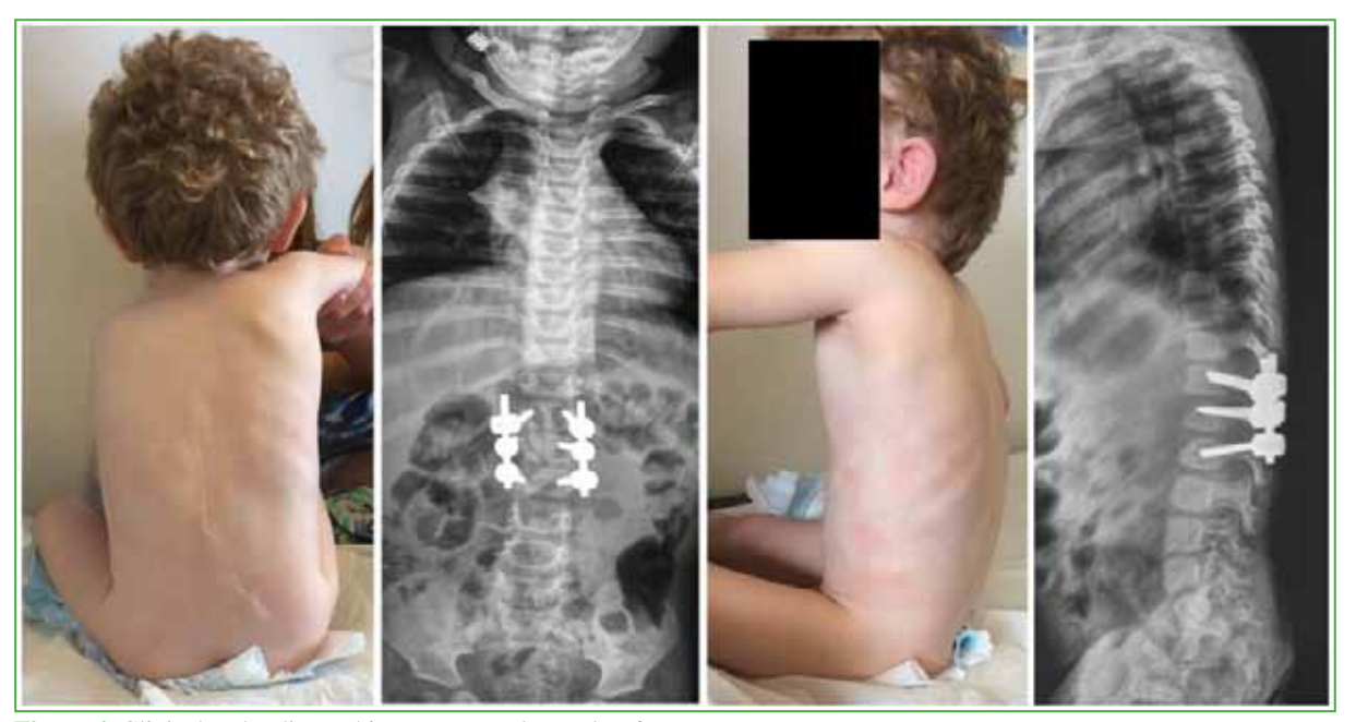
Figure 4. Clinical and radiographic appearance 2 months after surgery.

Therapeutic recommendations: <3, orthopedic treatment, 4, debatable, ≥5, surgery.