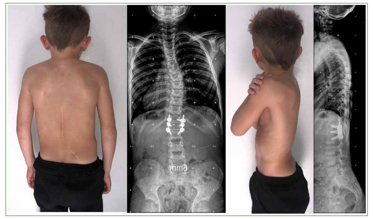
Figure 5. Clinical and radiographic appearance after 7 years of follow-up.