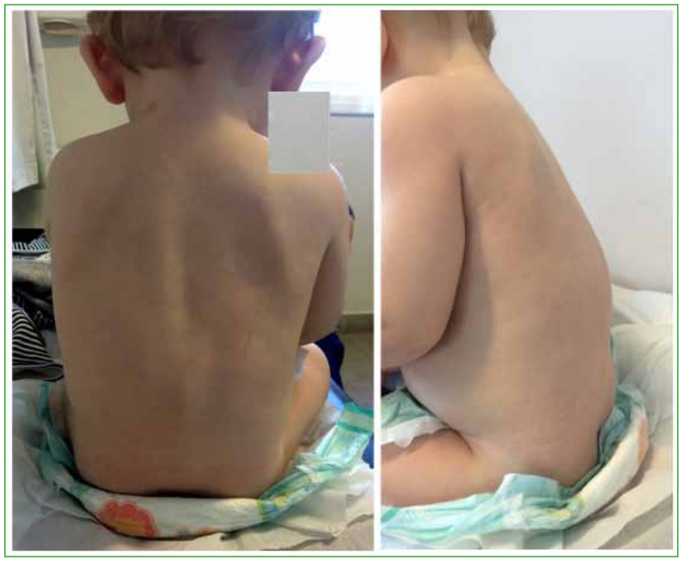
Figure 1. Clinical aspect. Note the thoracolumbar hump.