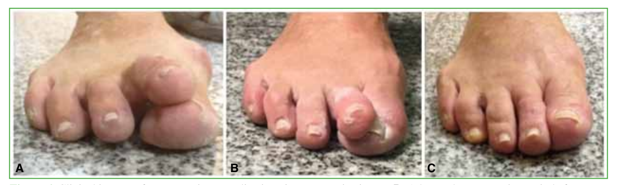
Figure 6. Clinical images of postoperative complication. A. Preoperative image. B. Advanced postoperative period after percutaneous distal metatarsal osteotomy plus osteosynthesis. C. Postoperative period after percutaneous osteotomy of the first phalanx for correction of varus deviation of the second toe.

Tables 1 and 2 show the demographic characteristics and postoperative outcomes of the patients treated with the surgical technique described in this case series, compared with those of the first 26 consecutive patients in the series treated with Weil osteotomy plus PIPJ arthrodesis at our institution.