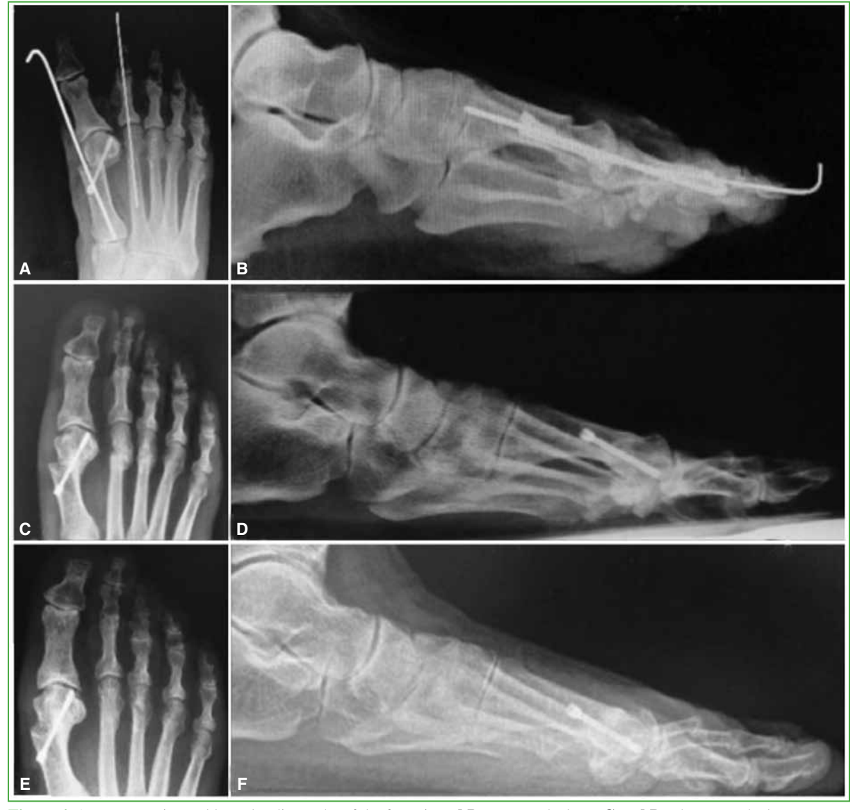
Figure 4. Anteroposterior and lateral radiographs of the foot. A and B. Two weeks later. C and D. Three months later. E and F. Six months later.