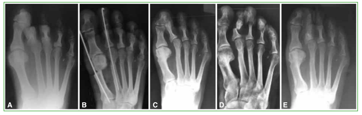
Figure 5. Postoperative complication. Weight-bearing foot radiographs, AP view. A. B. Immediate postoperative period. C. Varus misalignment of the second toe. D. Percutaneous osteotomy of the first phalanx. E. Radiographic control with consolidated osteotomy.