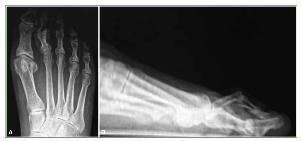
Figure 3. Preoperative weight-bearing foot radiographs. A. Anteroposterior B. Lateral.

Finally, these variables were compared to those of the first 26 consecutive patients with metatarsalgia and rigid hammertoes who underwent Weil and PIPJ arthrodesis at our Center. This approach involves conducting an open osteotomy parallel to the floor surface, from the dorsal region of the metatarsal head to the proximal, to accomplish shortening, which is then fixated with a 2.7 mm screw.