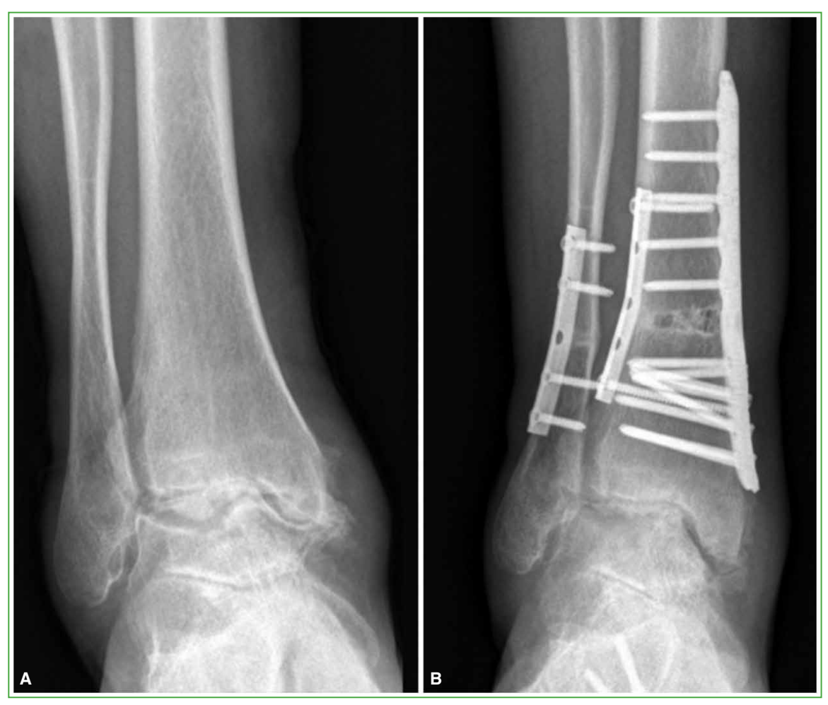
Figure 3. Takakura Stage IIIB. A. Preoperative ankle radiograph, AP view. B. Anteroposterior ankle radiograph, 2 years after internal supramalleolar opening-wedge valgus osteotomy.