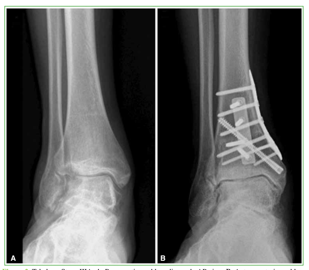
Figure 2 . Takakura Stage IIIA. A. Preoperative ankle radiograph, AP view. B. Anteroposterior ankle radiograph, 6 years after internal supramalleolar closing-wedge varus osteotomy.

SD = standard deviation; IQR = interquartile range.