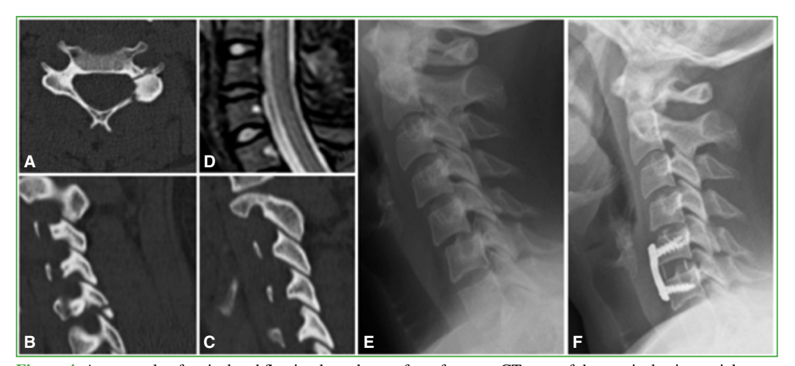
Figure 4. An example of an isolated floating lateral mass facet fracture. CT scan of the cervical spine, axial section ( A ), parasagittal sections ( B and C ). Magnetic resonance imaging suggests an associated intervertebral disc injury ( D ). Lateral radiograph of the cervical spine. Evidence of translation in the C5-C6 segment during follow-up ( E ). Surgical treatment with single-level anterior cervical discectomy and fusion ( F ).

Finally, 11 patients underwent surgery (initial surgery: n = 5; surgery as a rescue of failed conservative treatment: n = 6) (Figure 4). Of this group, only one patient required a two-level anterior cervical discectomy and fusion procedure. The rest underwent anterior single-level cervical disc fusion. A complementary posterior arthrodesis was performed in only one case.