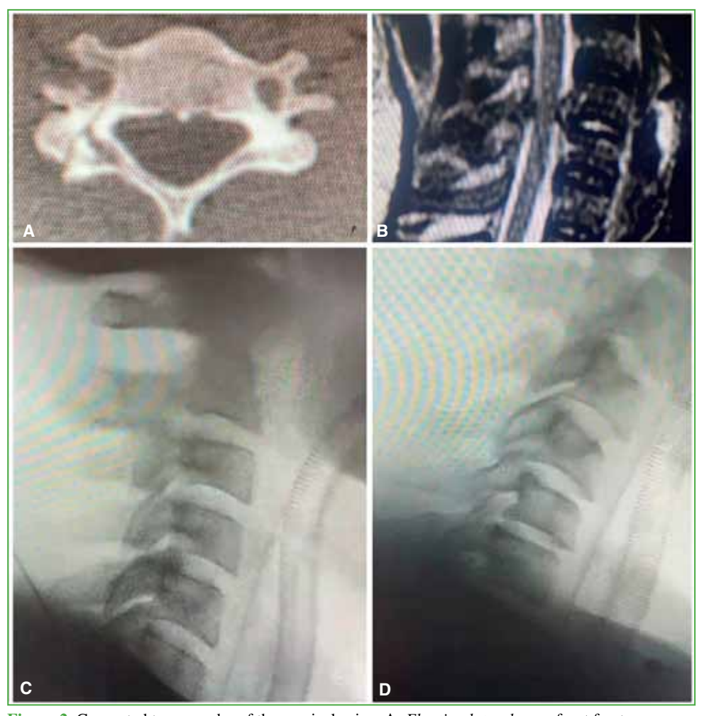
Figure 2. Computed tomography of the cervical spine. A. Floating lateral mass facet fracture. B. Intervertebral disc injury in the C5-C6 segment. C and D. Dynamic radiographs of the cervical spine. Signs of instability during image intensifier evaluation in the operating room.

16 patients were included, the average age was 42.86 (SD 12,396) years and the male gender predominated (n = 13; 81.25%). All patients were evaluated with CT and MRI. 68.75% (n = 11) had an intervertebral disc injury in the fractured segment (Figure 2) and 18.75% (n = 3) had tomographic evidence of anterolisthesis. None suffered an associated neurological injury (AIS E n = 16).