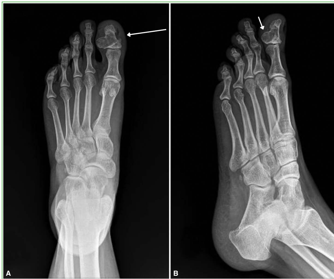
Figure 1. Radiographs of the right foot. A. Anteroposterior view. Eccentric lesion involving the proximal metaphyseal-diaphyseal region of the distal phalanx of the hallux (long arrow). B. Oblique view. Thinning of the dorsolateral cortex (short arrow).

Anteroposterior and oblique radiographs of the foot demonstrated an abnormality involving the distal phalanx of the hallux (Figure 1).