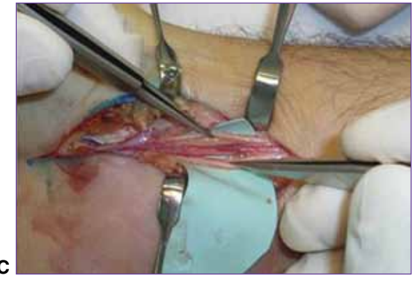
Figure. Intra-operative views. A. Storage of whitish substance on the median nerve surface. B and C. Same substance interwoven into nervous fibers; neurolysis and epineurotomy.