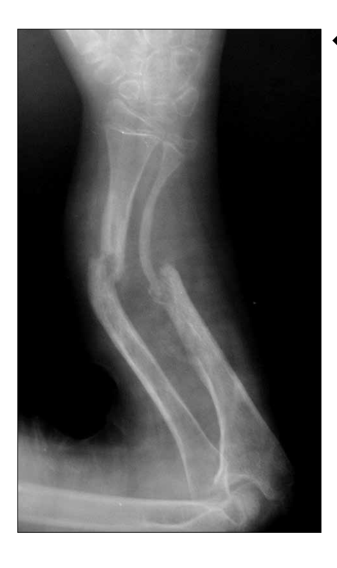
Figure 2. X-ray taken in consultation with us. It shows non-union in both forearm bones with radial head dislocation.