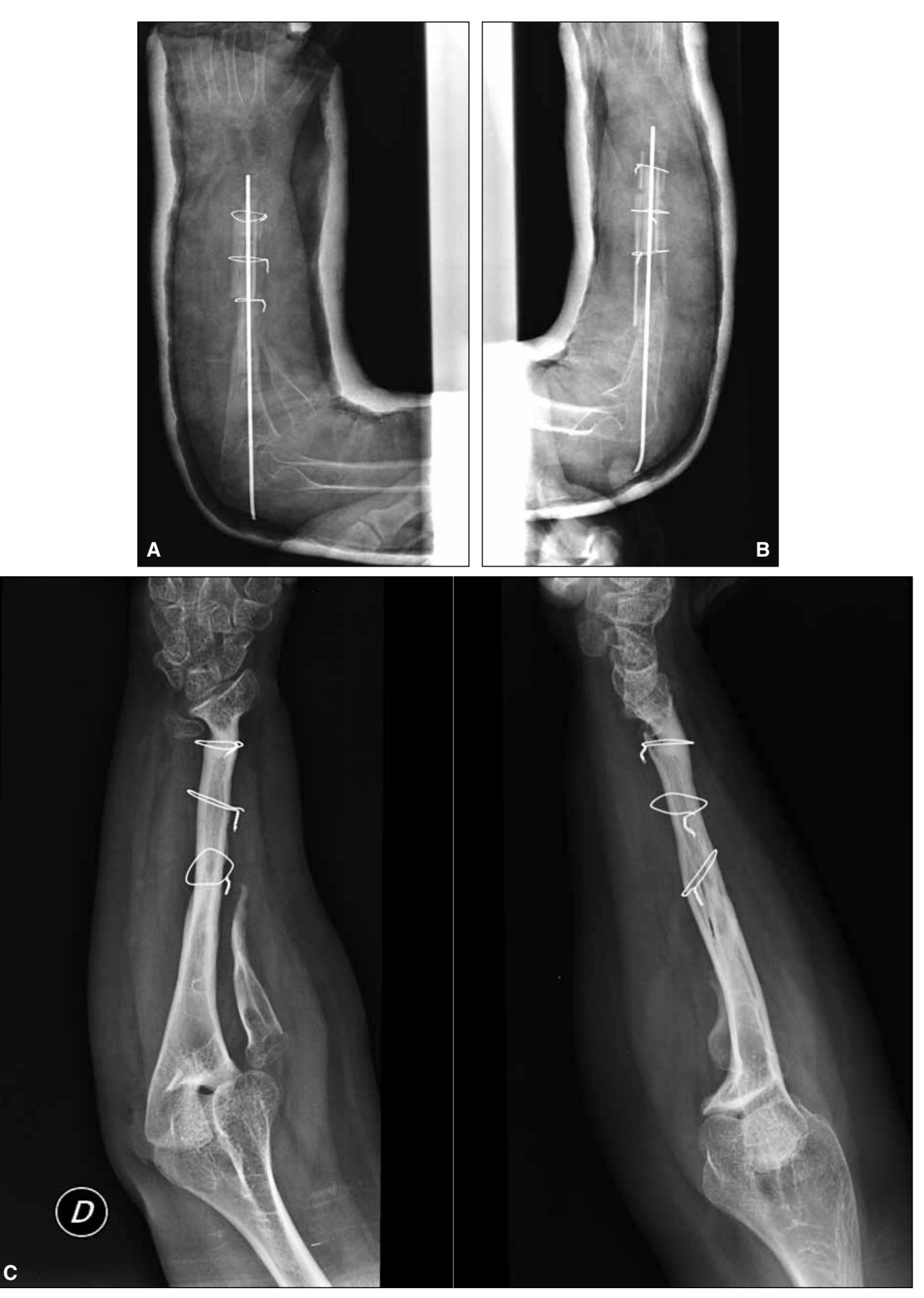
Figure 4. A and B. Post-operative X-ray after plate removal, intramedullary nail and autologous fibular graft. C. X-rays at 4<sup>th</sup> year follow-up: Non-union consolidation.