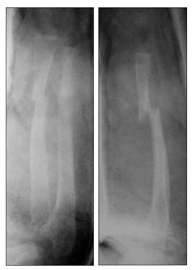
Figure 1. Initial X-rays at the time of the fracture.

Eight months after the surgery, we found re-absorption of the bone graft and plate loosening; therefore, we decided to carry out revision with removal of the osteosynthesis material, free auologous fibular bone graft and