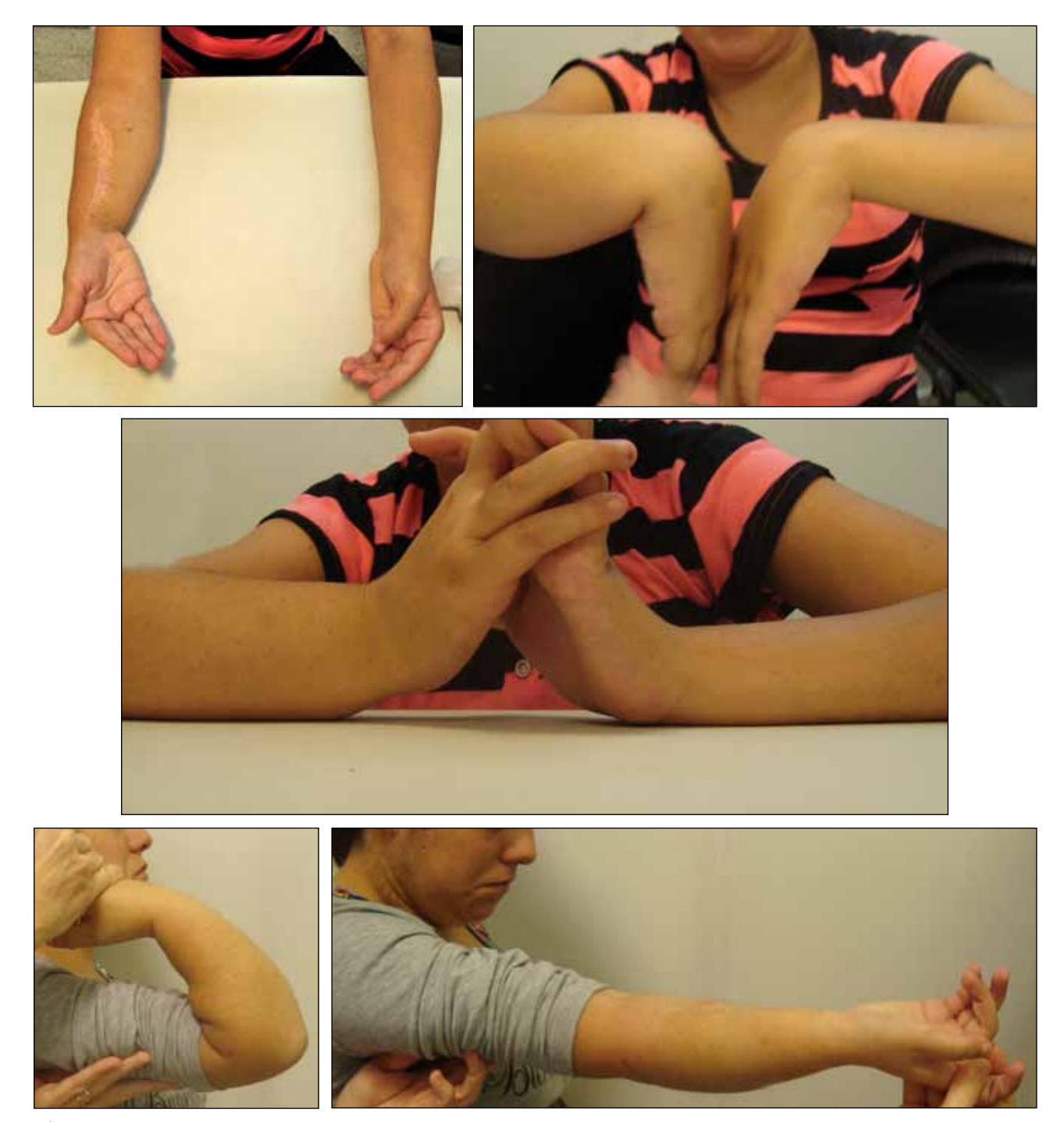
Figure 5. Medical status and range of motion.