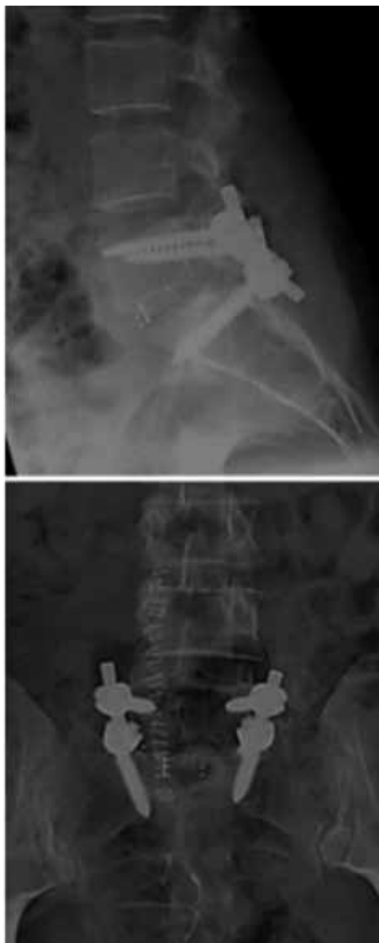
▲ Figure 2. Post-operative X-ray check.

Lumbosacral unilateral dislocations are infrequent injuries that result from high energy mechanisms. Diagnosis is based on proper physical examination and imaging (X-rays, CT scan and MRI). Nowadays, the treatment of choice consists of open setting, facetectomies, decompression and circumferential fixation with interbody cages and pedicle screws, so as to keep stability with restoration of alignment and decompression of neurologic elements.