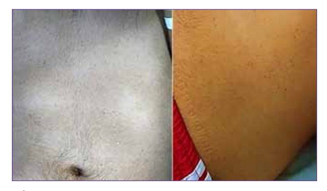
Figure 3. Petechial injuries widespread in the thorax-abdomen area.