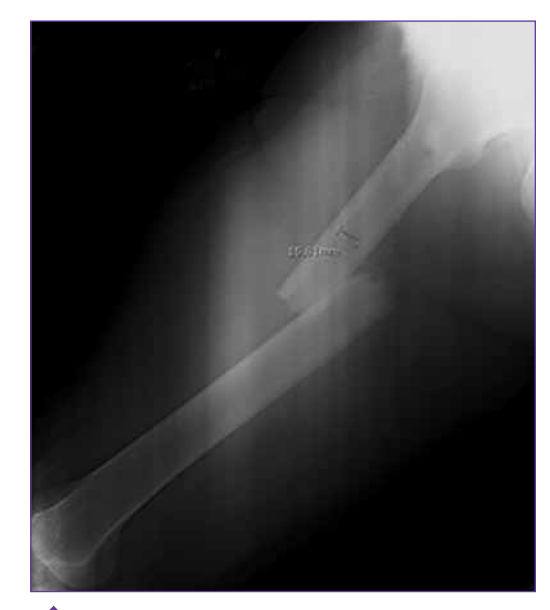
Figure 1. Fracture in the middle third of the right femoral diaphysis.

The patient is taken to the General Ward, where he receives the same management as he did at the ICU, including anticoagulation and i.v. fluids. He stays two more days in hospital and is discharged in good general conditions, and satisfactorily recovered from the neurological point of view. As a sequel, the patient reports bilateral scotoma at follow-up consultation three months after the accident.