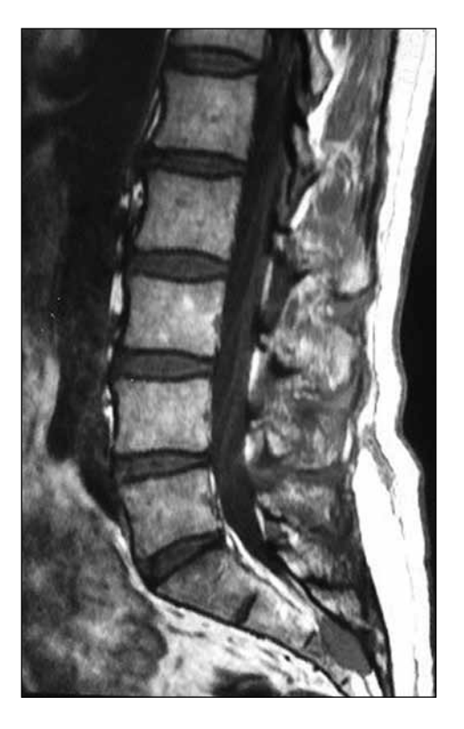
Figure 3. Forty-nine year-old male who consults for low back pain; T1 paramedian sagittal MRI section which shows an intra-canal lesion distal to S3 and spreading to the body and the posterior arch. Histological diagnosis: Isolated metastasis from prostate cancer.

Figure 2. Sixty-five year-old male who consults for low back pain and urinary dysfunction; T1 paramedian sagittal MRI section which shows a lesion involving bone structures from S1 downwards, with cortical spread. Histological diagnosis: Chordoma.