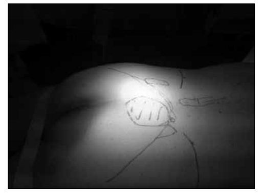
Figure 4. Pre-operative patient's situation and planning, with projection of the sacral tumor to the skin.

Figure 3. Forty-nine year-old male who consults for low back pain; T1 paramedian sagittal MRI section which shows an intra-canal lesion distal to S3 and spreading to the body and the posterior arch. Histological diagnosis: Isolated metastasis from prostate cancer.