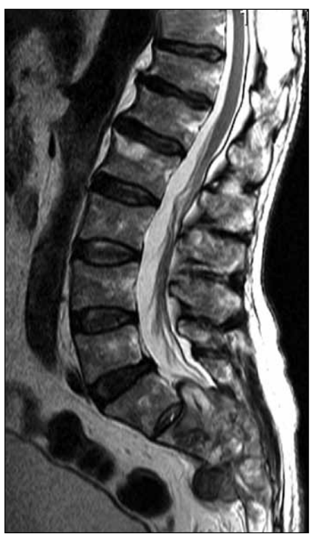
Figure 2. Sixty-five year-old male who consults for low back pain and urinary dysfunction; T1 paramedian sagittal MRI section which shows a lesion involving bone structures from S1 downwards, with cortical spread. Histological diagnosis: Chordoma.

Figure 1. Fifty-six year-old female who consults for low back pain and urinary dysfunction; T2 paramedian sagittal MRI section which shows a lesion involving the spinal canal from S3 to S4, with no cortical spread. Histological diagnosis: Malignant tumor in the nervous sheath.