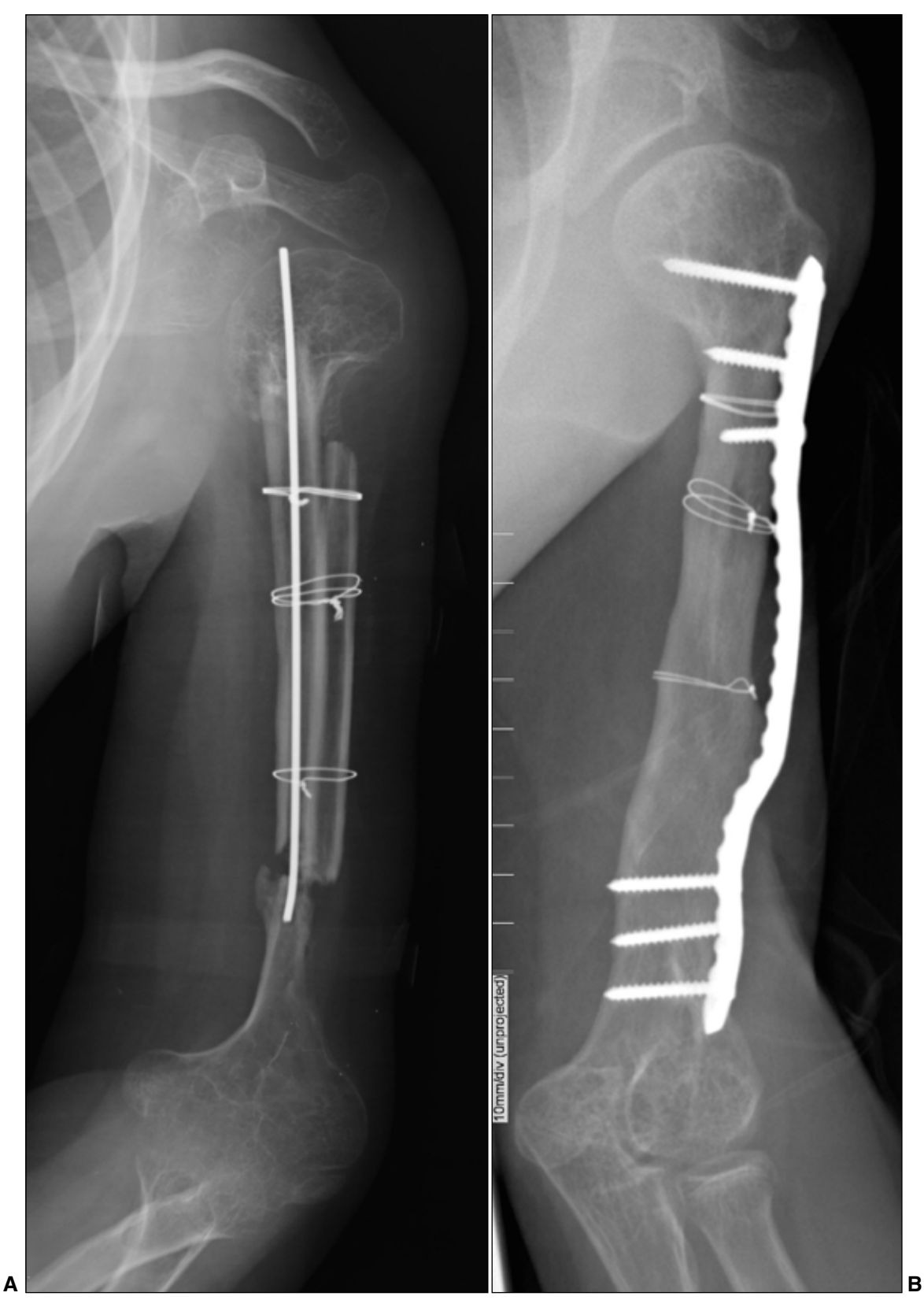
Figure 2. A. Humeral 12-cm bone defect with atrophic bone ends. Non-vascularized free double fibular graft stabilized with wire. B. Eight months later, bone ends have hypertrophied and the wire was replaced with wave LCP plate and cancellous bone autograft in the distal bone end, with which bone continuity, stability and progressive remodeling were achieved.