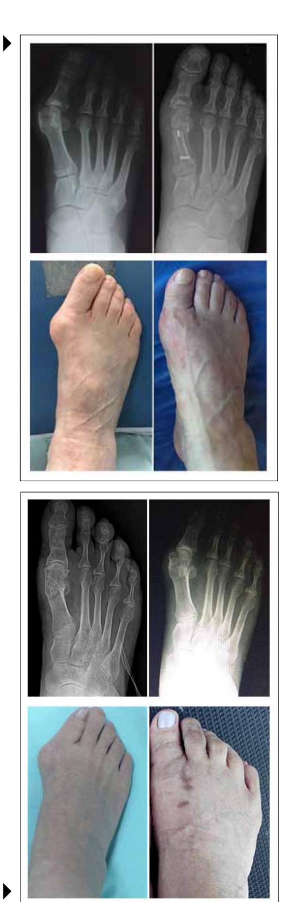
Figure 2. Preoperative and postoperative follow-up. Minimally-invasive surgery.

^*Median (IQR). MTF = metatarsophalangeal, IMT = intermetatarsal, AVD = activities of daily living