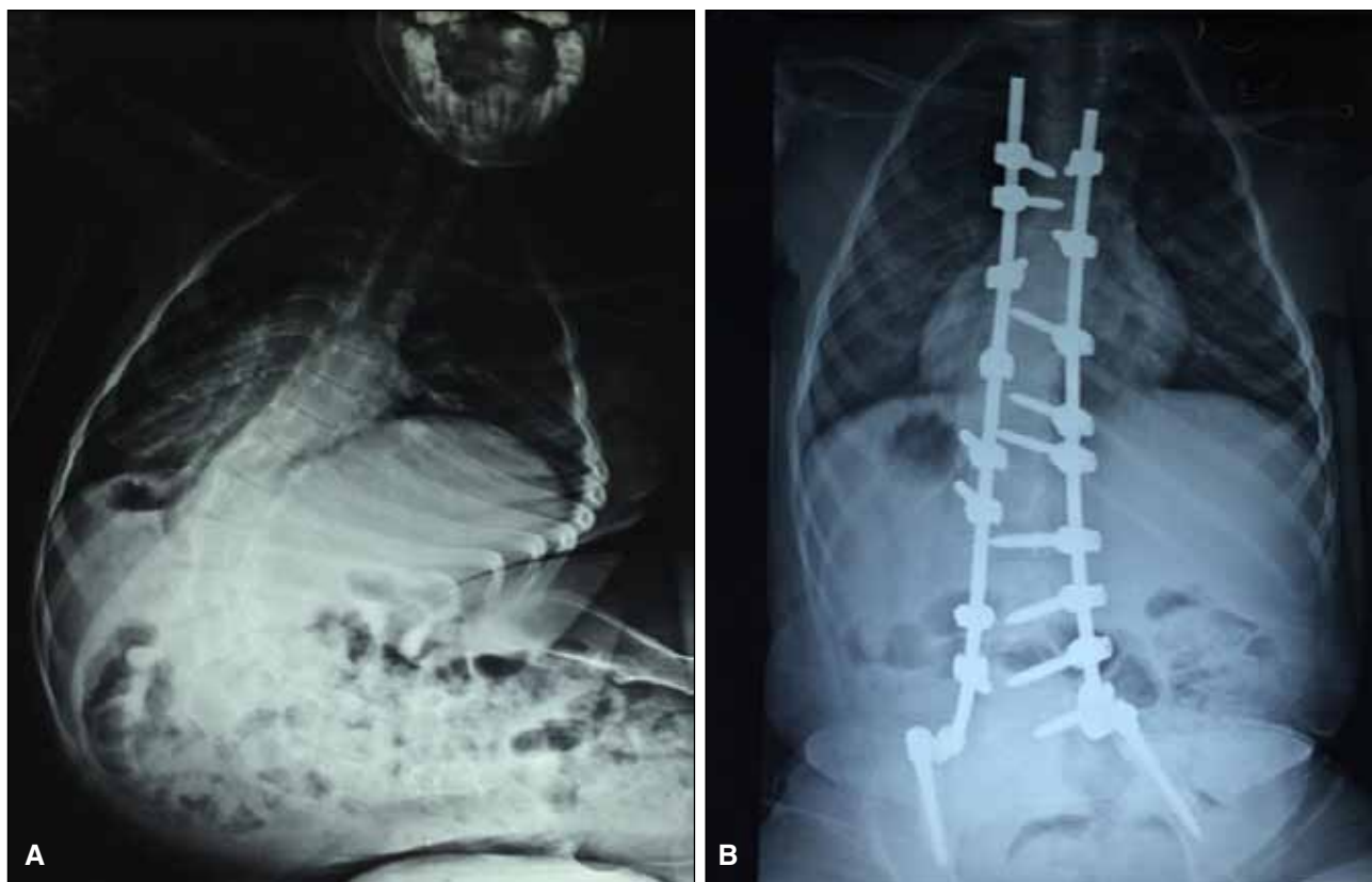
▲ Figura 2. Eleven year-old patients with diagnosis of muscular dystrophy. A. Preoperative X-ray with thoracolumbar curvature of 128°. B. X-ray one year after the surgery with Cobb angle=24°.

Although ours is a retrospective study which includes a limited number of patients, our results were similar to those in the other studies. It is worth mentioning that most benefits after the neuromuscular scoliosis surgery were: capability to keep sitting posture and to carry out day-to-day activities. Moreover, caregivers' high rates of satisfaction with the surgical procedure are also worth highlighting.