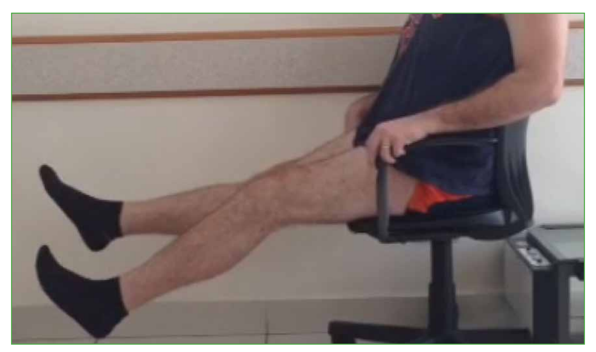
Figure 1. Clinical image showing an active extension deficit of 30° with respect to the contralateral knee.

Due to the patient's pain, instability and inability to achieve a full extension, a new surgical treatment was indicated: knee extensor mechanism reconstruction with allograft.