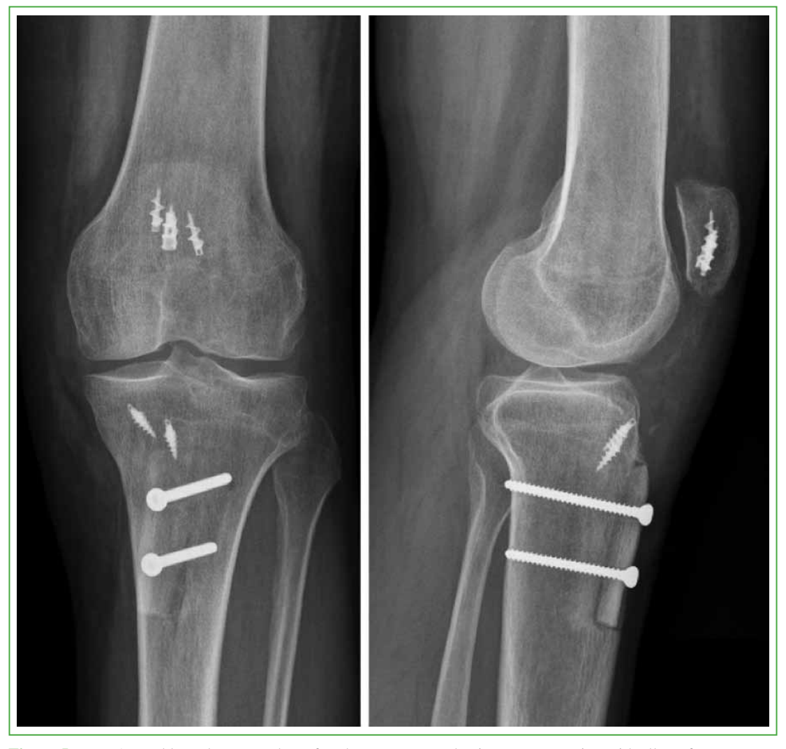
Figure 5. Knee AP and lateral X-rays taken after the extensor mechanism reconstruction with allograft.