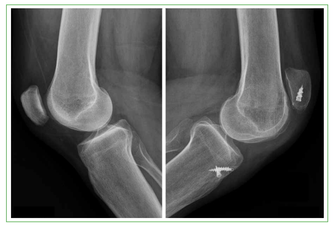
Figure 2. Comparative knee lateral X-rays. showing patella alta in the left knee with respect to the patellar height of the right knee (Insall-Salvati index of 2 and 1.2, respectively).