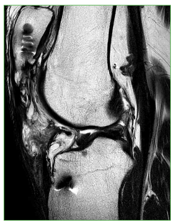
Figure 3. Patellar tendon disruption and associated patella alta. The TA-patella distance is 9cm.