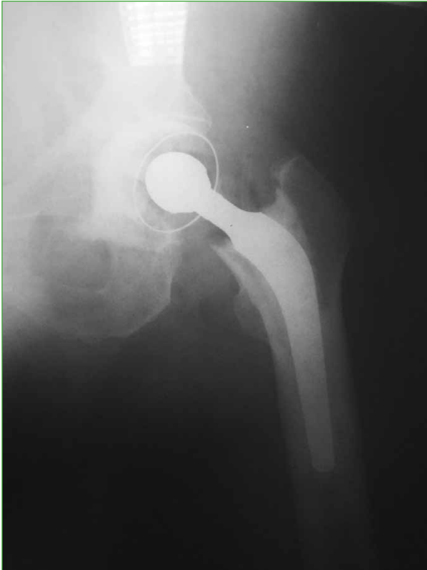
Figure 2. Postoperative anteroposterior X-ray revealing a satisfactory outcome.

Under spinal anesthesia, the patient was placed in the right lateral decubitus position. The patient underwent a cemented THA with a modified Gibson approach. A Steinmann pin was inserted at the greater trochanter to facilitate dislocation/relocation and to control the stump rotation. THA included a Charnley-type femoral component with a 28mm head and a Muller acetabular cup (28mm × 42mm) (Figure 2). Postoperative management included antibiotic prophylaxis for 48 hours and antithrombotic therapy for 15 days to prevent thromboembolic and infectious complications.