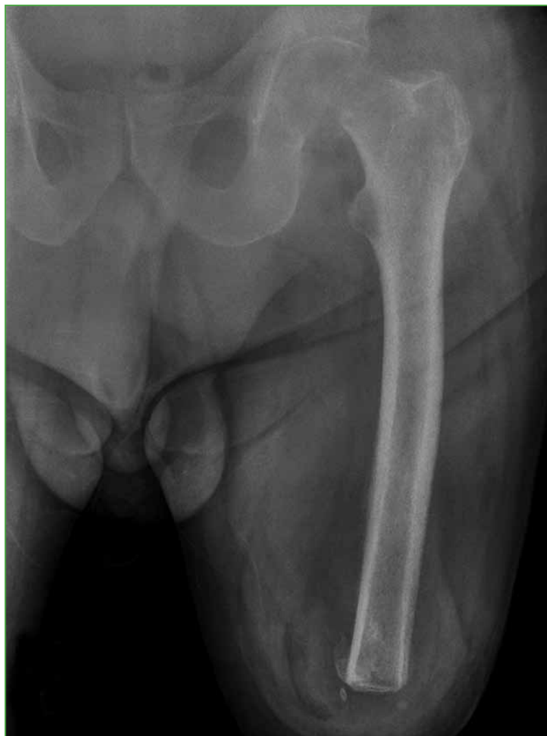
Figure 1. Preoperative left hip anteroposterior X-ray. Image reveals a non-displaced femoral neck fracture.

A 63-year man, under treatment for diabetes and hypertension, with left transfemoral amputation and 1-year evolution, presented to the Hospital Emergency Room after sustaining a hip trauma from a standing-height fall. He was diagnosed with a grade II femoral neck fracture, according to Garden's classification ( Figure 1 ).