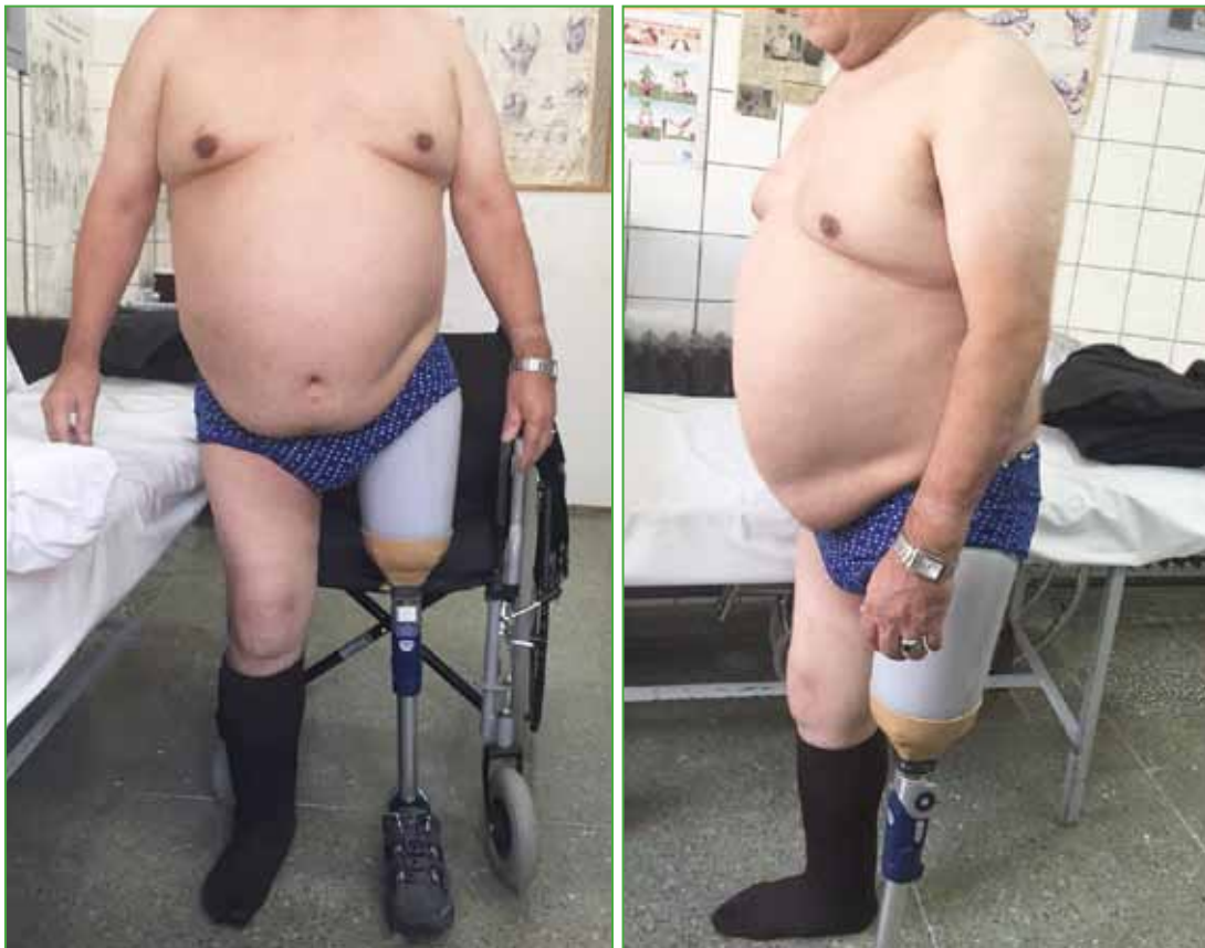
Figure 3. Patient at 15-month postoperative follow-up.

A 15-month follow-up revealed no prosthesis dislocation or infectious complications. The surgical wound was completely healed and dry. The patient had a satisfactory hip range of motion: flexion was 85°, external and internal rotation was 30°, abduction was 40°, and adduction was 20°. The patient was painless, able to walk with a cane and to independently perform his activities of daily living, using his artificial leg (Figure 3).